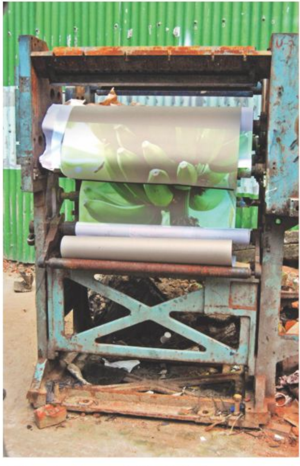
of the mirror were tied with different segments of newspapers. The installation titled “Indrajal” was conceived by Hossain Mahmood Rocky, a final year student of

On one corner of the exhibition was a mirror installed on the net of multifarious faces with different expressions. All four sides