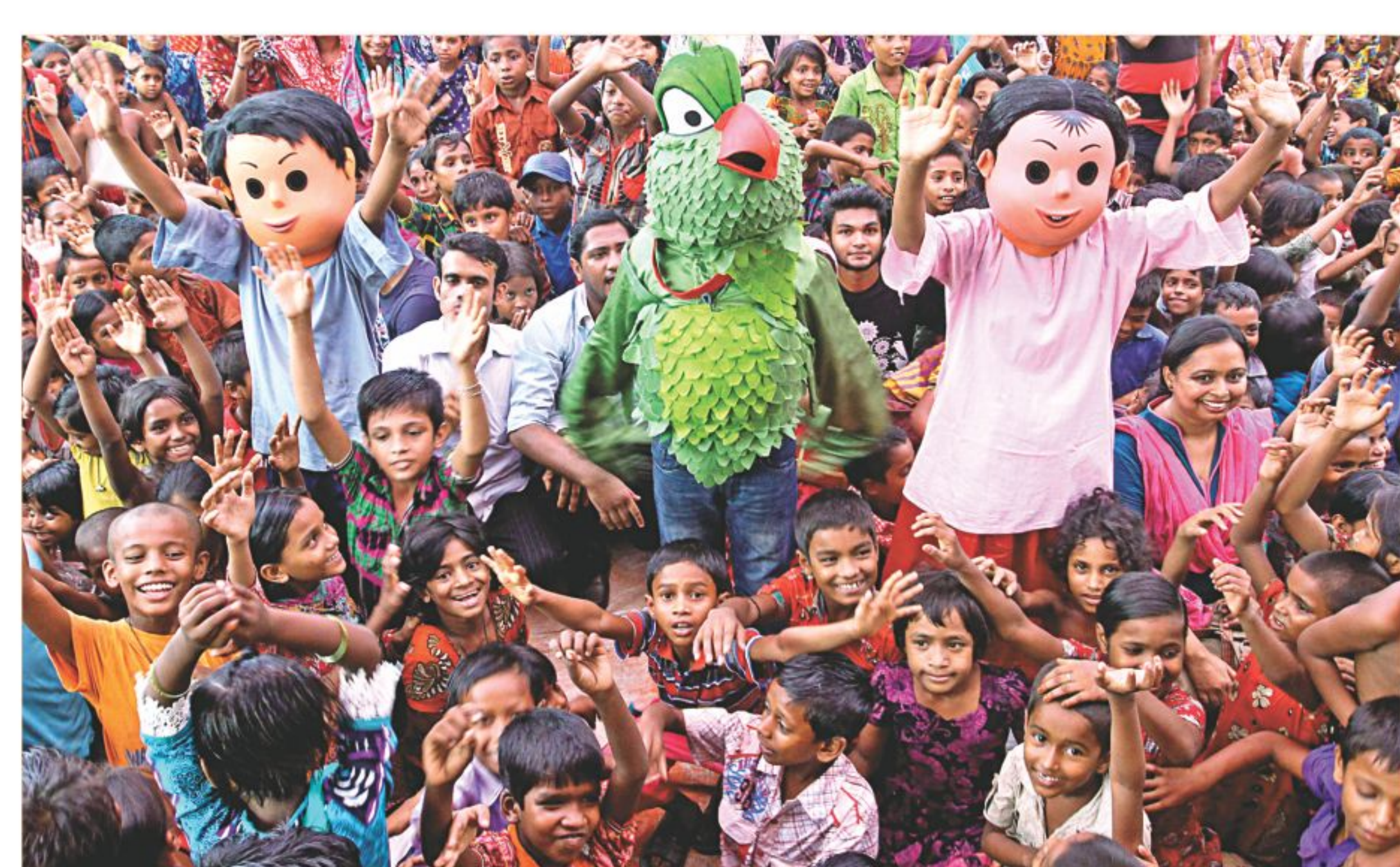
Three children of Gulshan's Korail slum dress up as characters from the cartoon Meena in a programme organised by Unicef, Enabling Environment for Child Rights and the Ministry of Women and Children Affairs on BTCL college grounds in Banani in the capital yesterday to observe Meena Day 2013. This year's theme is "Child Marriage and Child Labour Can be Prevented if Quality Education is Ensured".