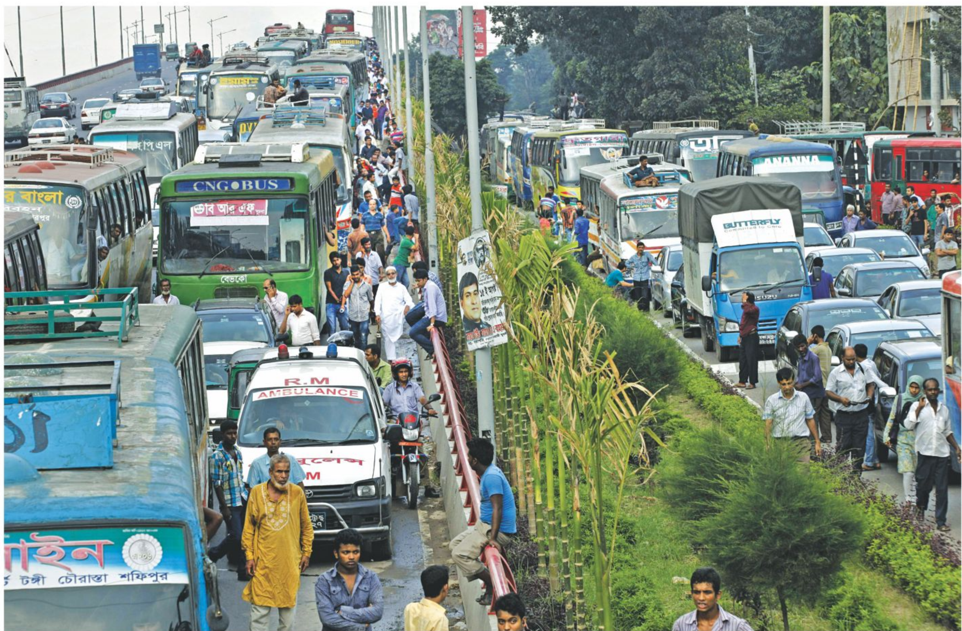
Labour unrest over pay hike caused huge traffic congestions across the capital yesterday. In this photo taken around 2:00pm, vehicles are seen stuck in an enormous traffic jam all along the Banani flyover.