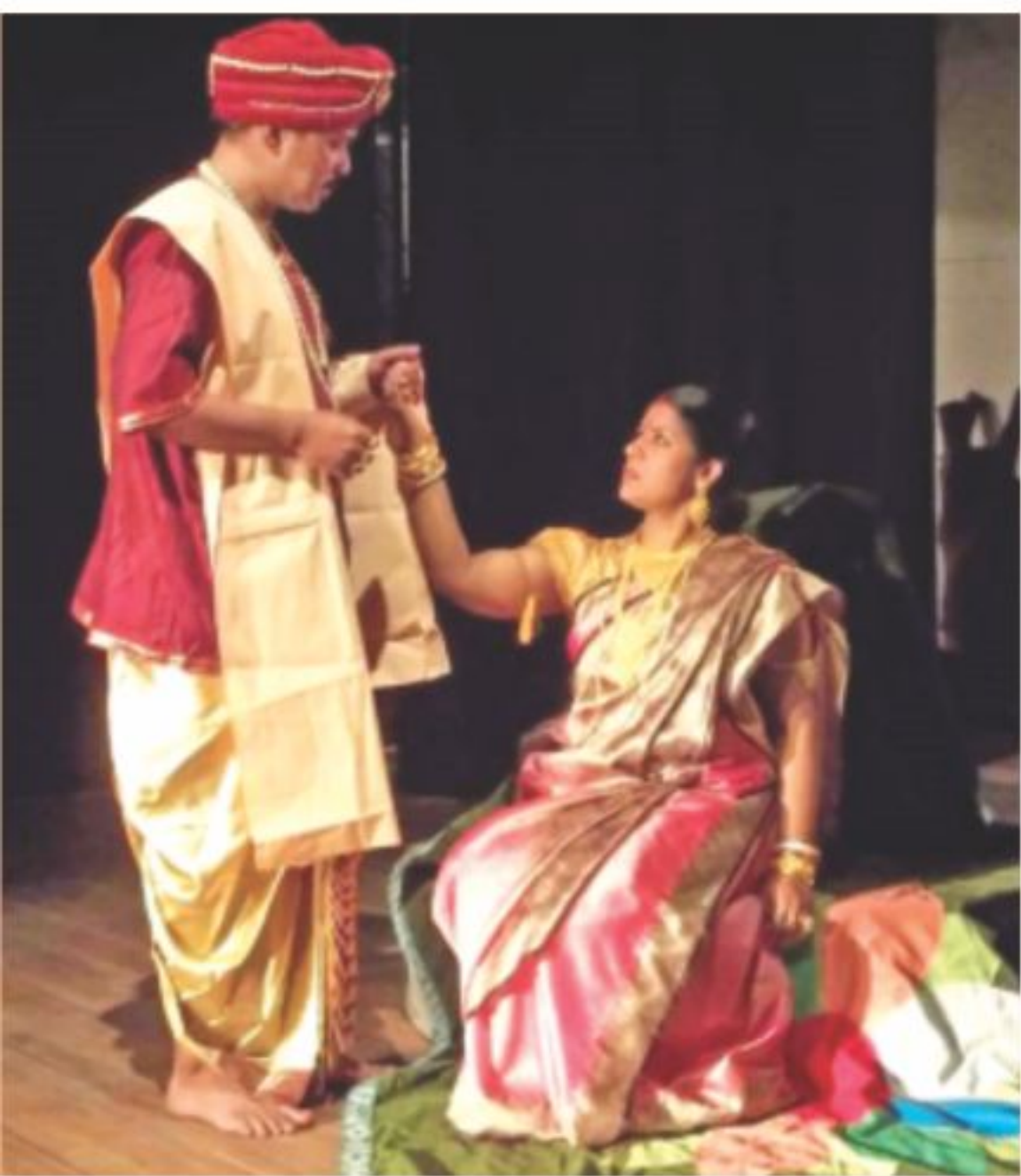
A scene from "Bisharjan".