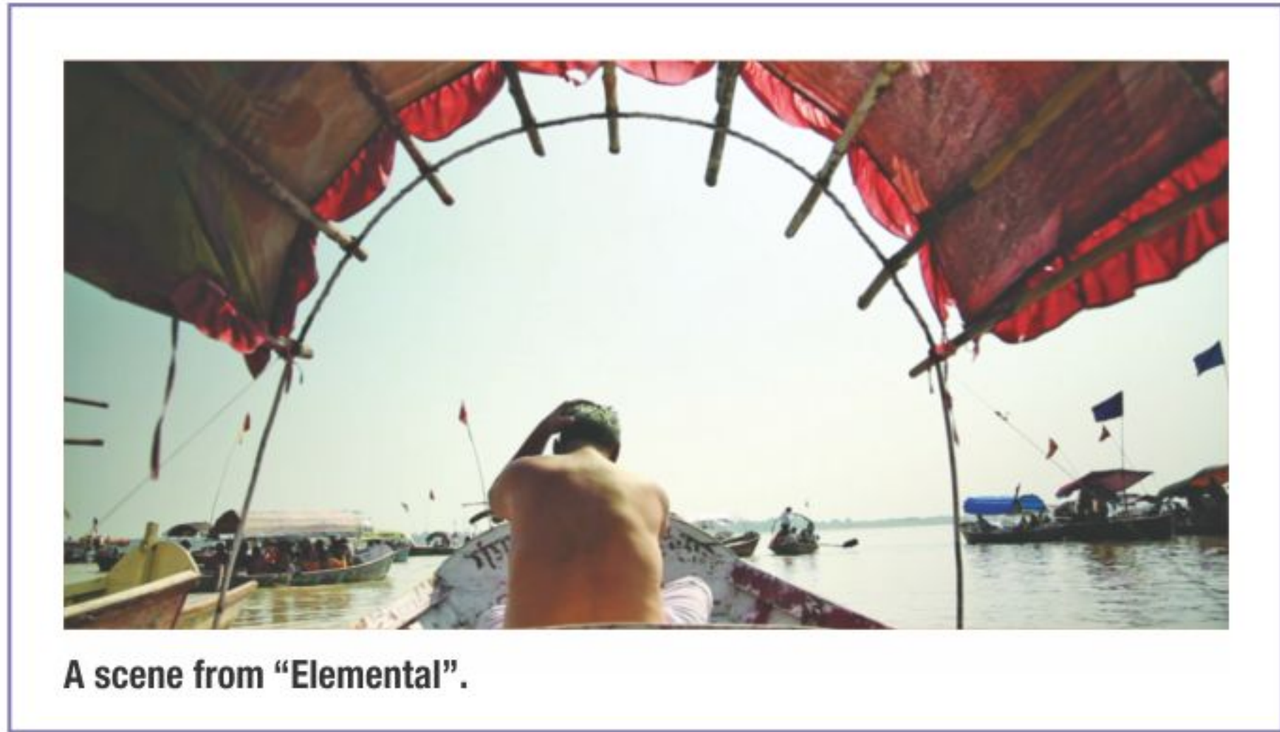
A scene from "Elemental".