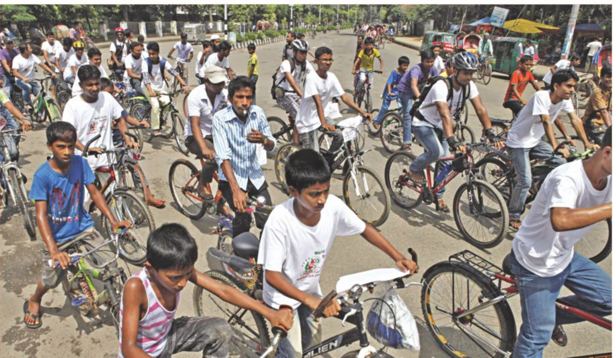
Bangladesh Cycle Lane Bastobayan Parishad brings out a bicycle rally in the capital's Teacher-Student Centre in Dhaka University yesterday demanding separate bicycle lanes and that the day be declared "World Cycling Day".