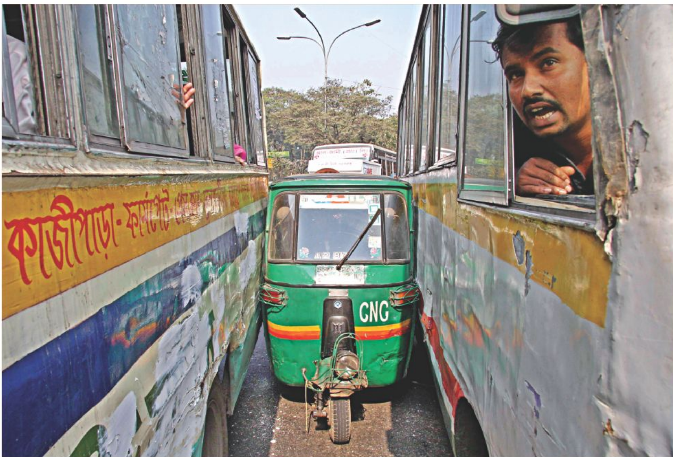
This photo taken on January 15, 2010, in Manik Mia Avenue, is an ideal instance of reckless driving on the streets of the capital. On average, 3,300 people have died every year in the country over the last decade due to irresponsible driving.