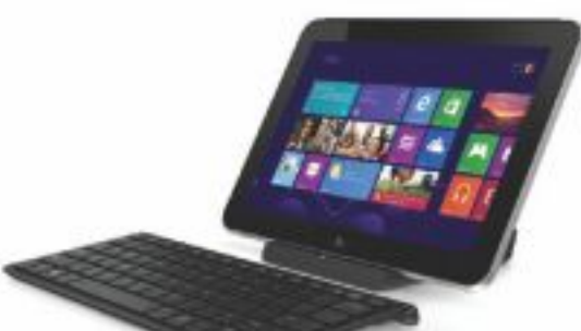
HP ElitePad Docking Station^