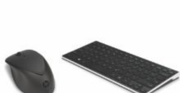
HP ElitePad Bluetooth Keyboard and Mouse^

Connect with us www.facebook.com/HPBangladesh VISIT: Our Authorized Partners CLICK: www.hp.com/personal