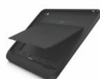
HP Expansion Jacket^

Built for business with Windows 8 Pro^ and enterprise-class security. And thanks to a suite of productivity-enhancing accessories like Smart Jackets, you can have a desktop PC experience when you're in the office or a nimble and light tablet when you're anywhere else. The new HP ElitePad - it works in all the ways you do.