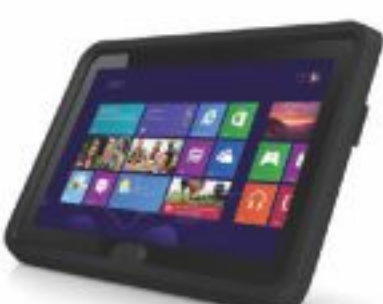
HP ElitePad Rugged Case^