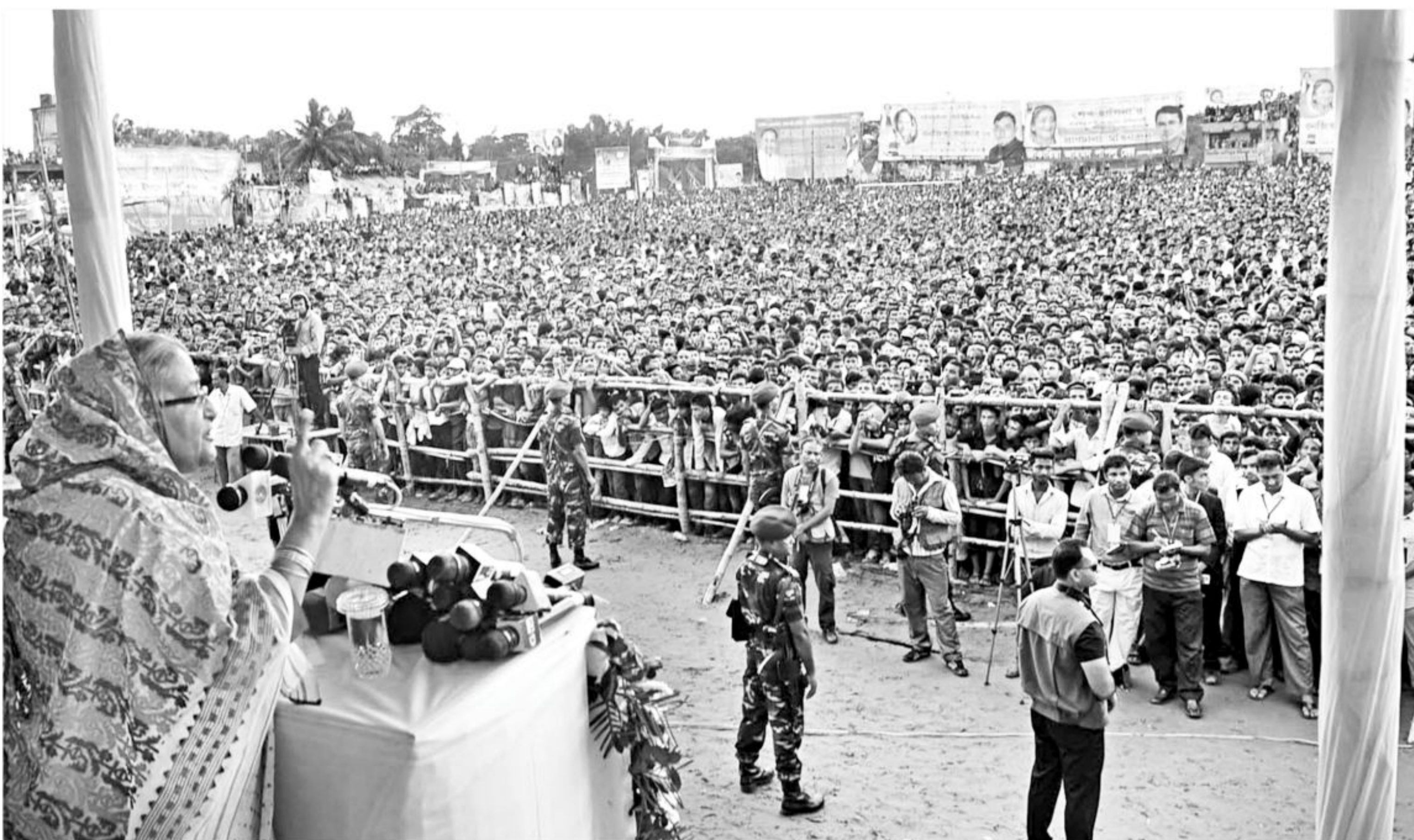
Prime Minister Sheikh Hasina addressing a rally in Golapganj of Sylhet yesterday.

He said around 2.83 lakh illegal power connections across the country were snapped.