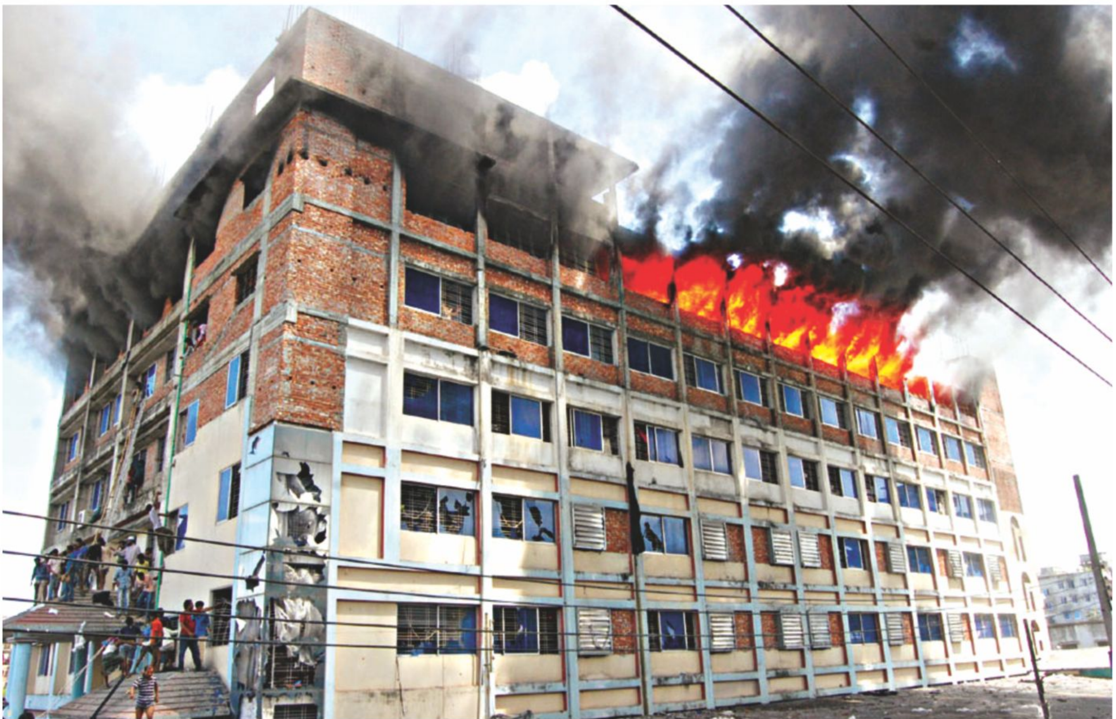
Flames leaping out of the Sicily Garments Factory at the capital's Nandipara in Madartek yesterday. Three workers were injured after the blaze broke out around 12:45pm. Story on page 5.

The government had planned to start the construction of a 6.15-kilometre rail-road bridge and complete major part of the bridge within its tenure. It could not be possible, however, as the donors cancelled funds over allegations of corruption in the project.