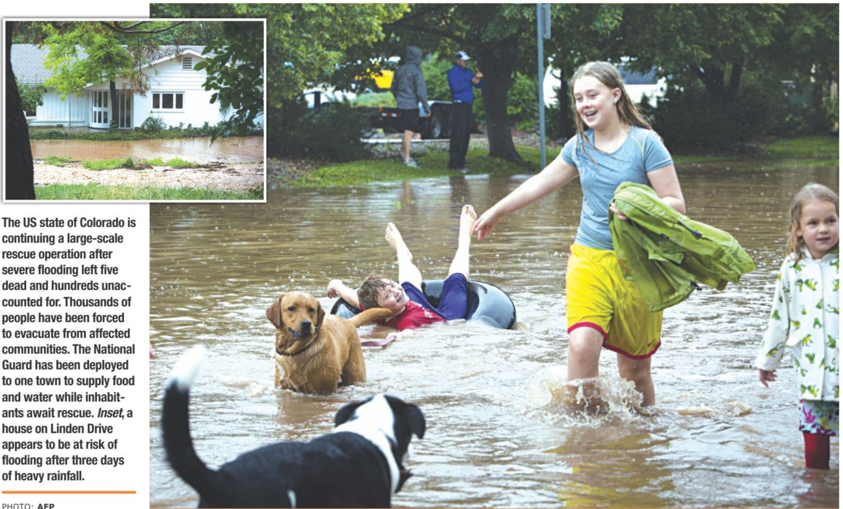
The US state of Colorado is continuing a large-scale rescue operation after severe flooding left five dead and hundreds unaccounted for. Thousands of people have been forced to evacuate from affected communities. The National Guard has been deployed to one town to supply food and water while inhabitants await rescue. Inset, a house on Linden Drive appears to be at risk of flooding after three days of heavy rainfall.

A Russia-US accord on the dismantling of Syria's chemical stockpile will also weigh heavily on Security Council consultations expected to be called Monday.