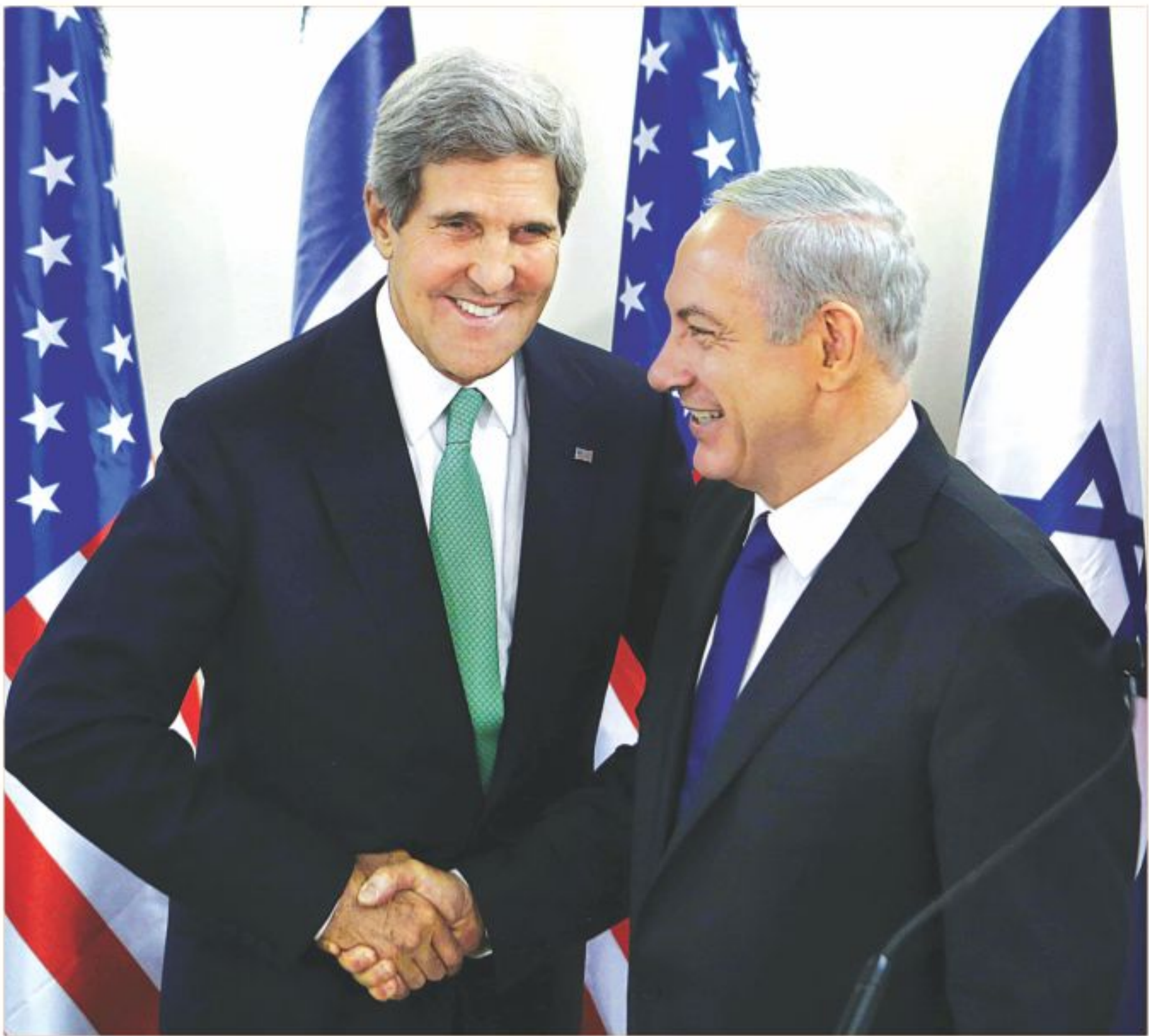
US Secretary of State John Kerry shakes hands with Israeli Prime Minister Benjamin Netanyahu during a press conference at the prime minister's office in Jerusalem yesterday.

Tropical Storm Manuel has hit the western coast, on the Pacific Ocean, bringing almost twice the monthly rainfall in just three days.