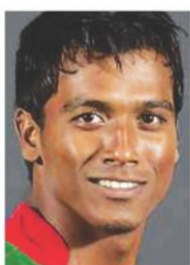
RUBEL ... 6 for 18

"There was a bit of moisture on the wicket early on and Rubel utilised that to perfection. He bowled in good