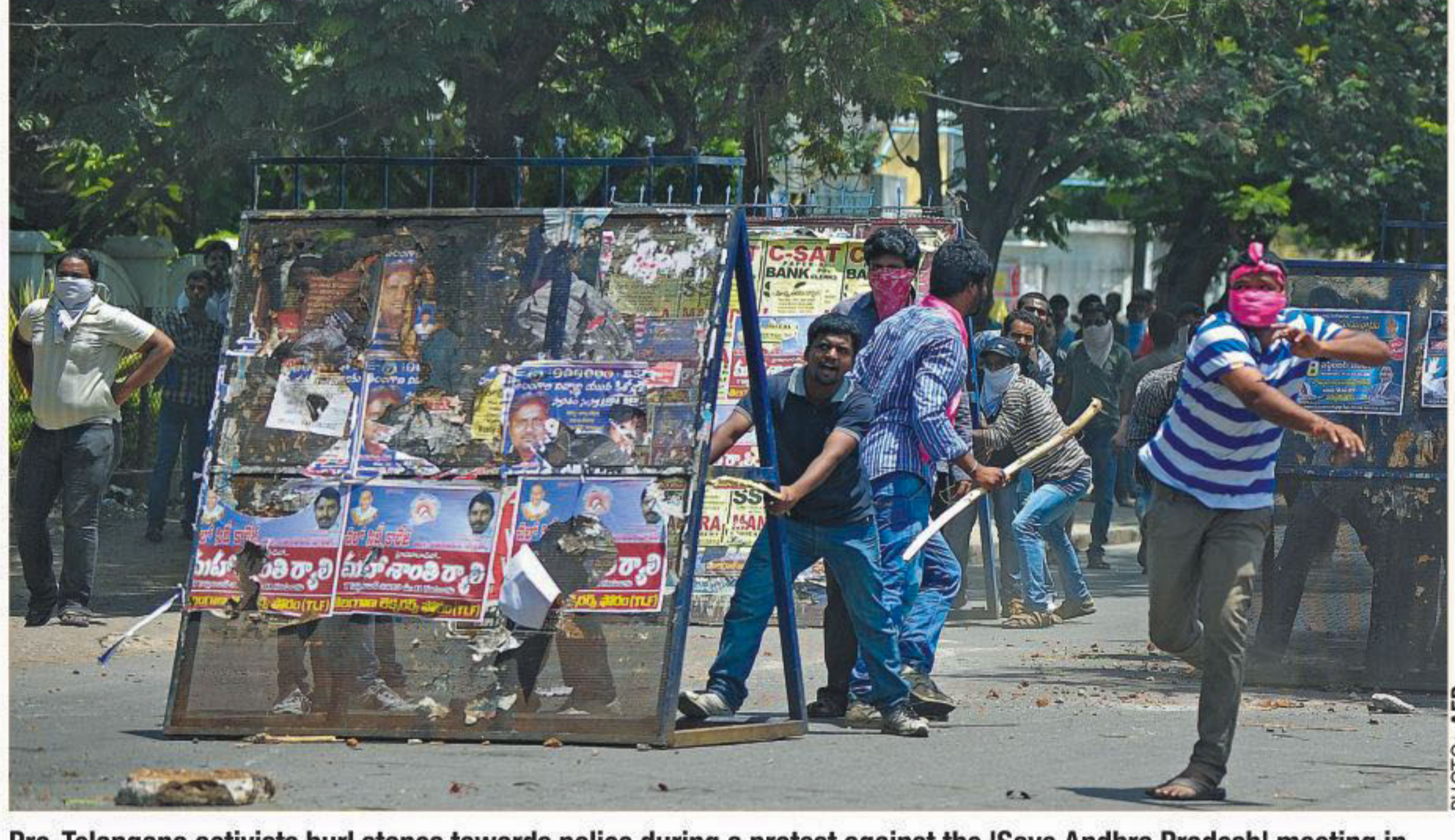
Pro-Telangana activists hurl stones towards police during a protest against the 'Save Andhra Pradesh' meeting in Hyderabad yesterday. Andhra Pradesh Non-Gazetted Officers employees organised the public meeting against the proposed bifurcation of the state, while pro-Telangana groups held a 24-hour strike in protest of the gathering.