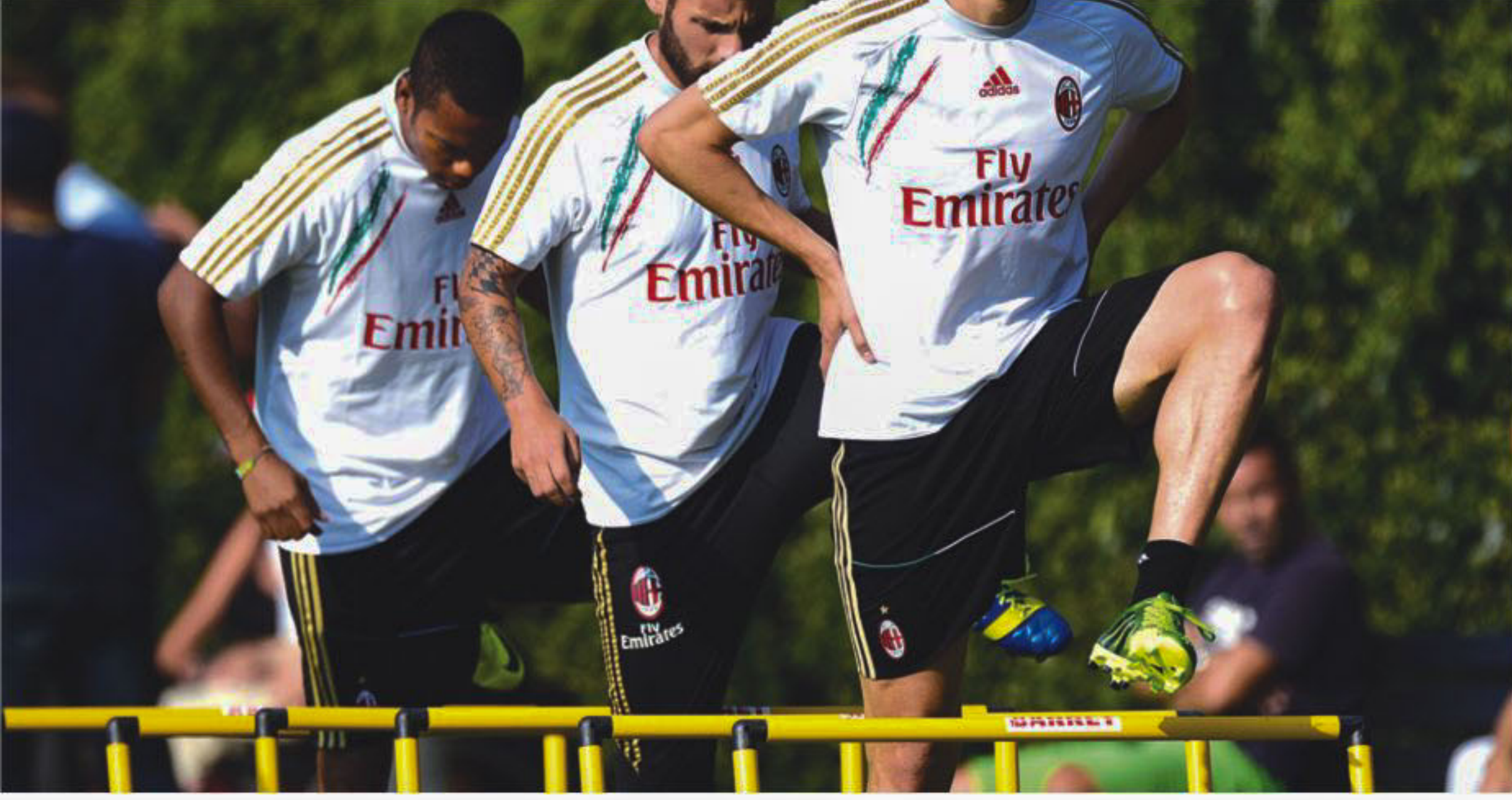
Milan forward Kaka (R) takes part in training at the team's Milanello training centre in Carnago on Thursday.

"These two seasons have flown by... but to me this is good because when you are enjoying things and you are happy, time goes quicker.