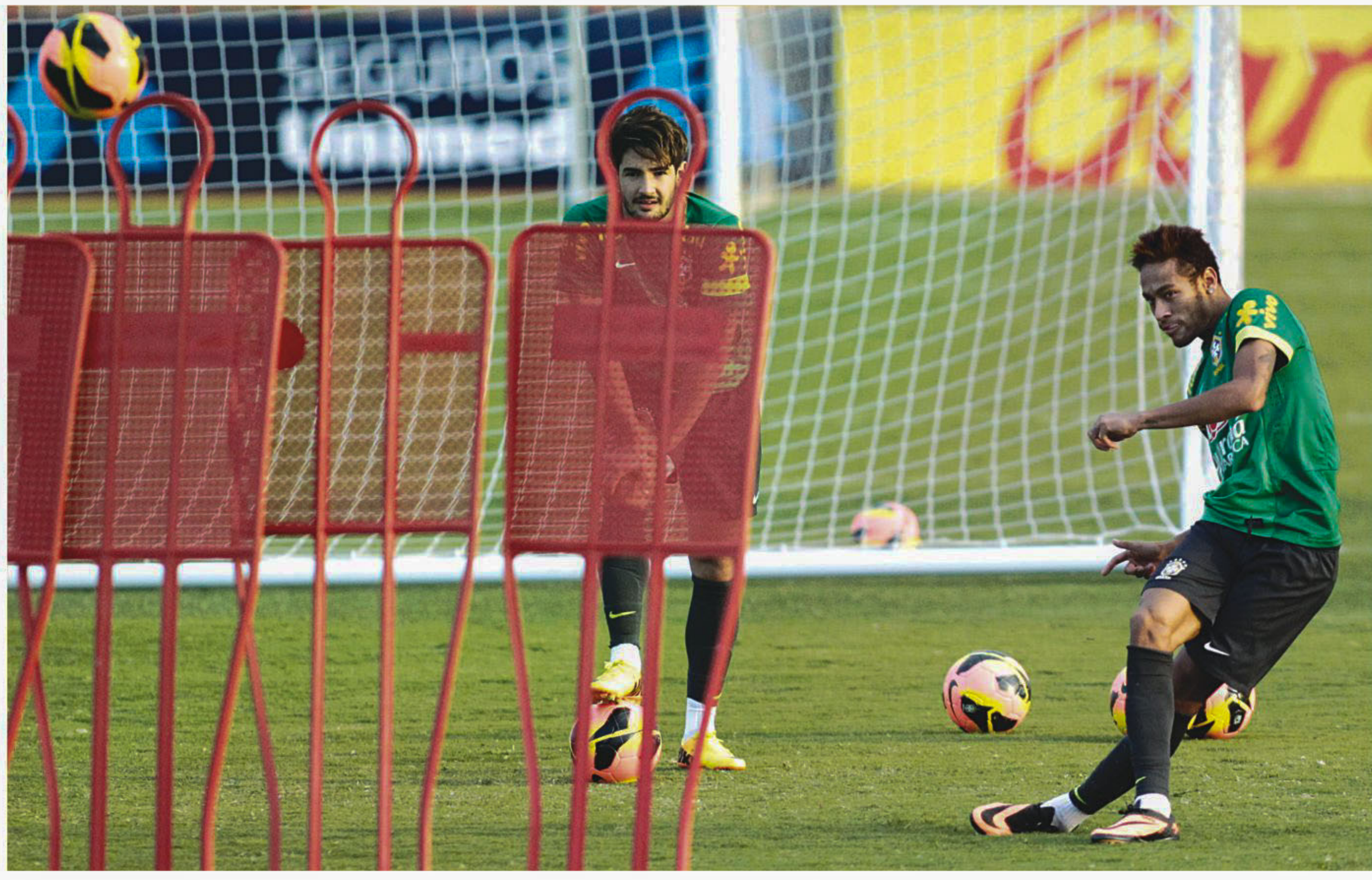
Brazil star Neymar practises free-kicks during a training session in Brasilia on Thursday ahead of their tonight's friendly match against Australia.

Supporters will receive a full refund for a complete wash-out and the two teams will now have to wait until Old Trafford, Manchester, on Sunday to resume cricketing combat in the second of the ODIs.