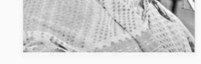
Prime Minister Sheikh Hasina addresses a crowd at the Ena Park Mela ground in Bagmara upazila of Rajshahi yesterday.