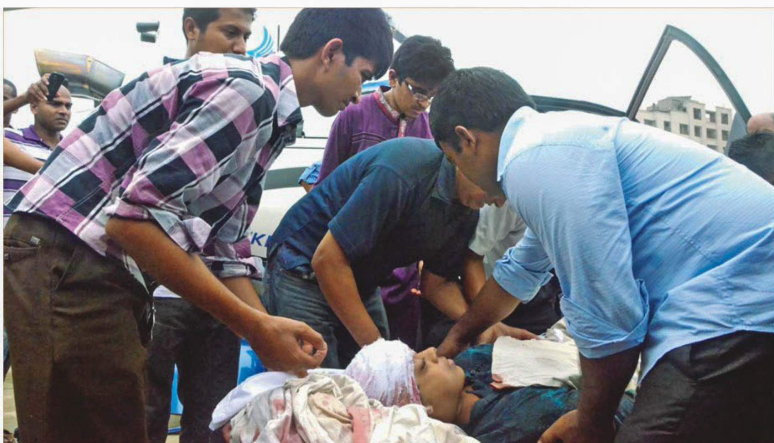
A student of Barisal University, hacked by her unwelcome suitor, being brought to Dhaka yesterday on a helicopter. She breathed her last at Dhaka Medical College Hospital in the afternoon.