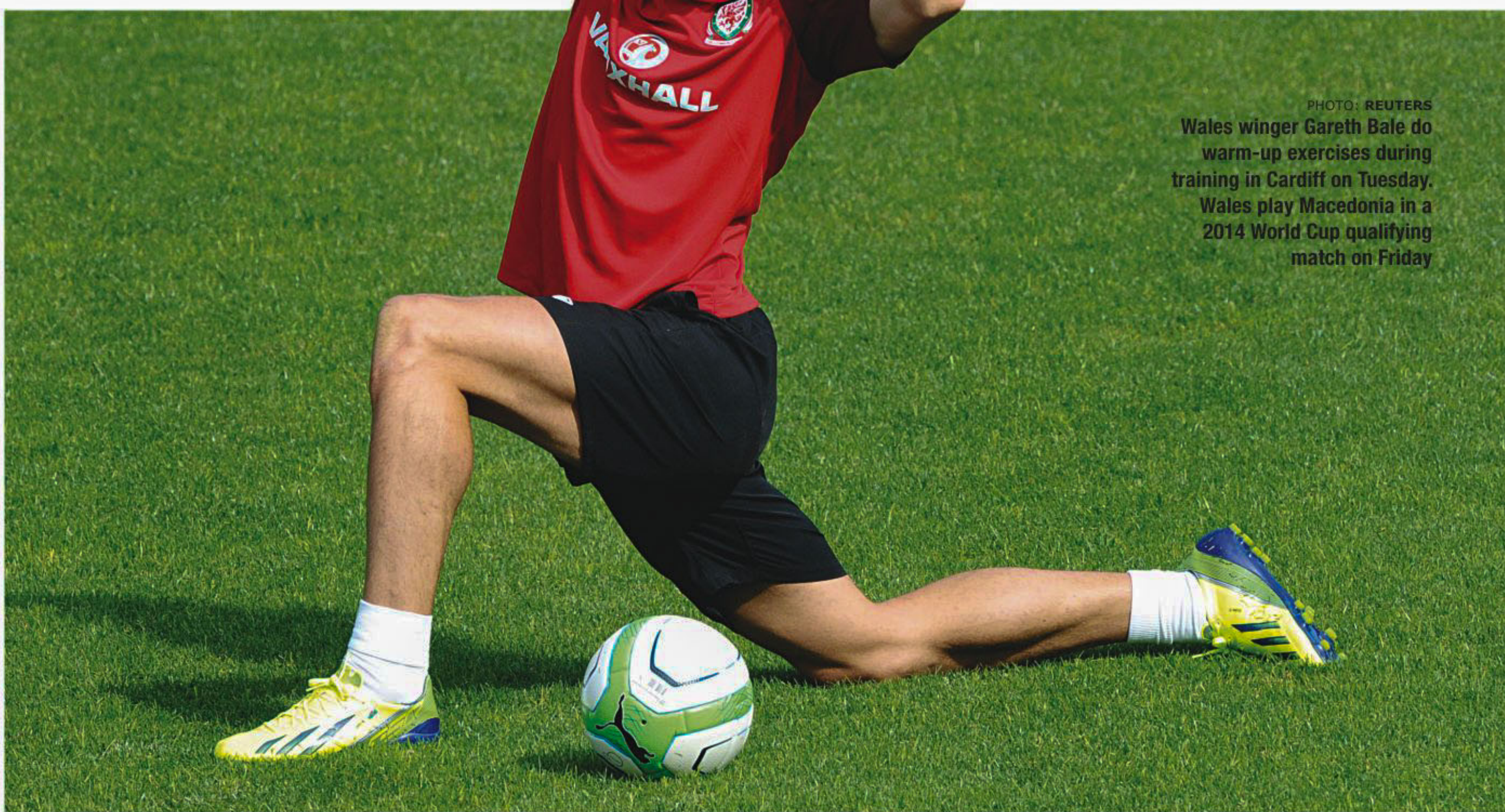
Wales winger Gareth Bale do warm-up exercises during training in Cardiff on Tuesday. Wales play Macedonia in a 2014 World Cup qualifying match on Friday