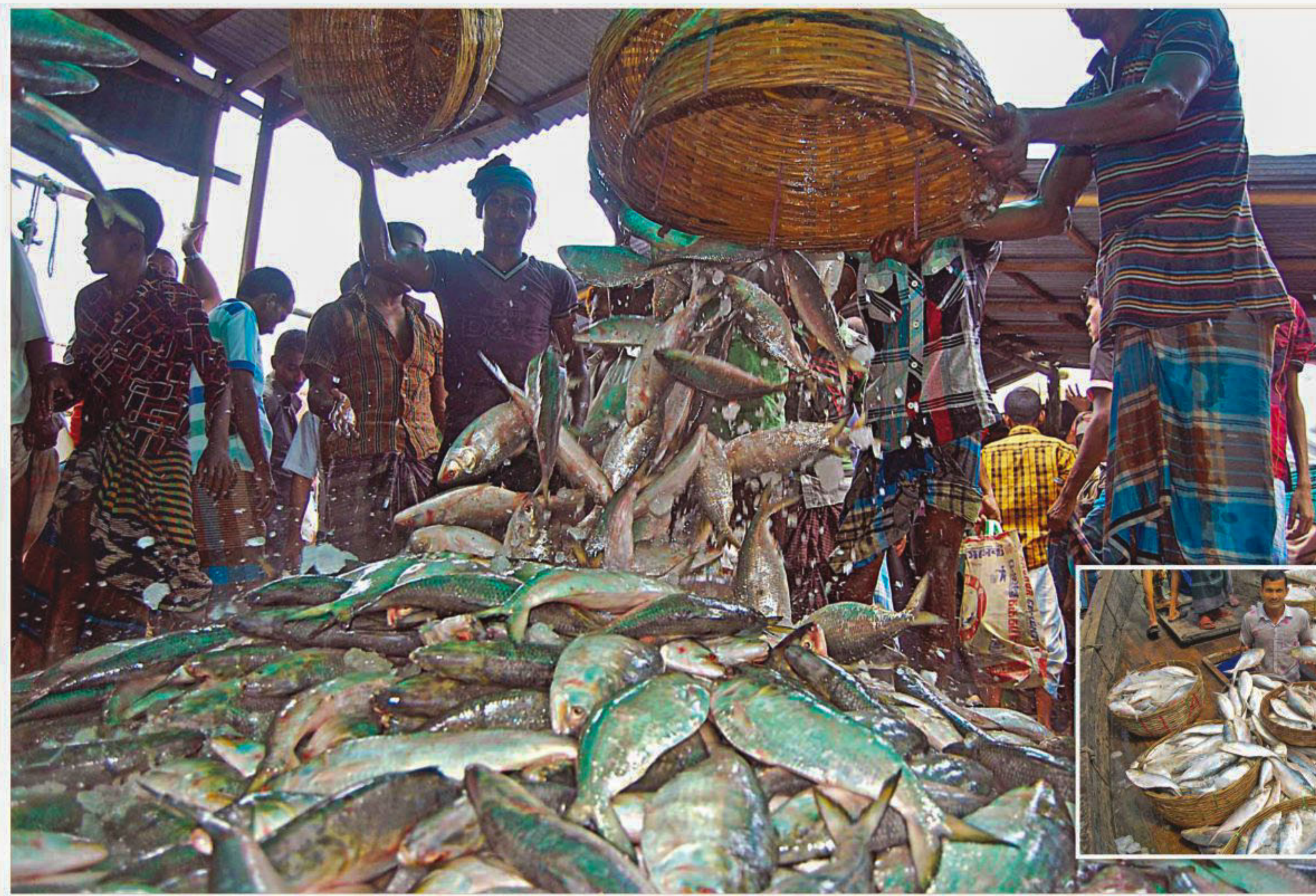
Fishermen have been catching huge quantities of hilsa from Barisal region over the last few days with the season paying dividends. The photo was taken yesterday at the Fish-landing Station on Port Road of Barisal.