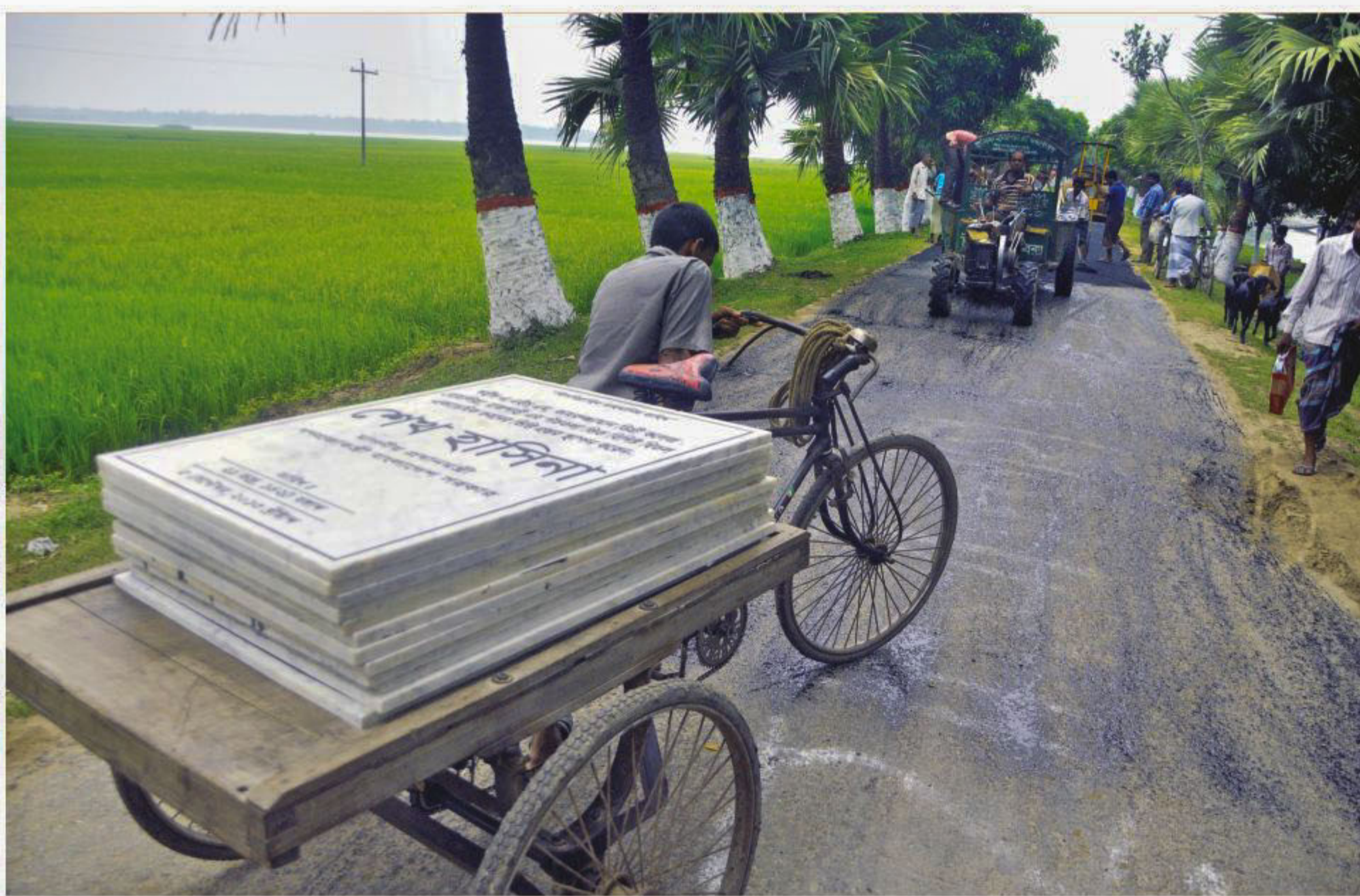
A road is getting a fresh layer of tarmac while a rickshaw van carries several foundation and inauguration stones with Prime Minister Sheikh Hasina's name engraved on them at Bagmara of Rajshahi on Tuesday. The premier is scheduled to visit the upazila today.