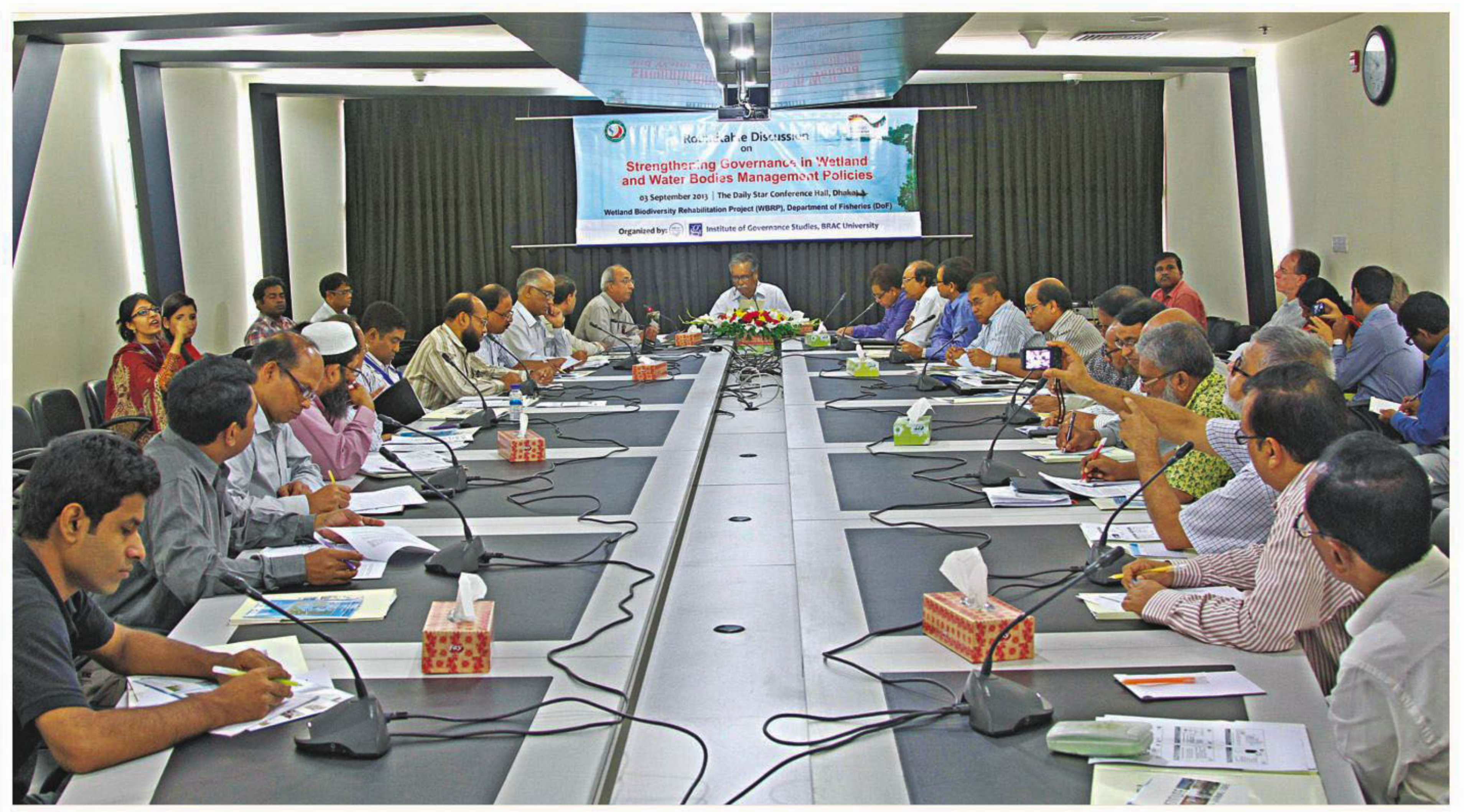
Participants at a roundtable titled "Strengthening Governance in Wetland and Water Bodies Management Policies" at The Daily Star Centre in the capital yesterday.