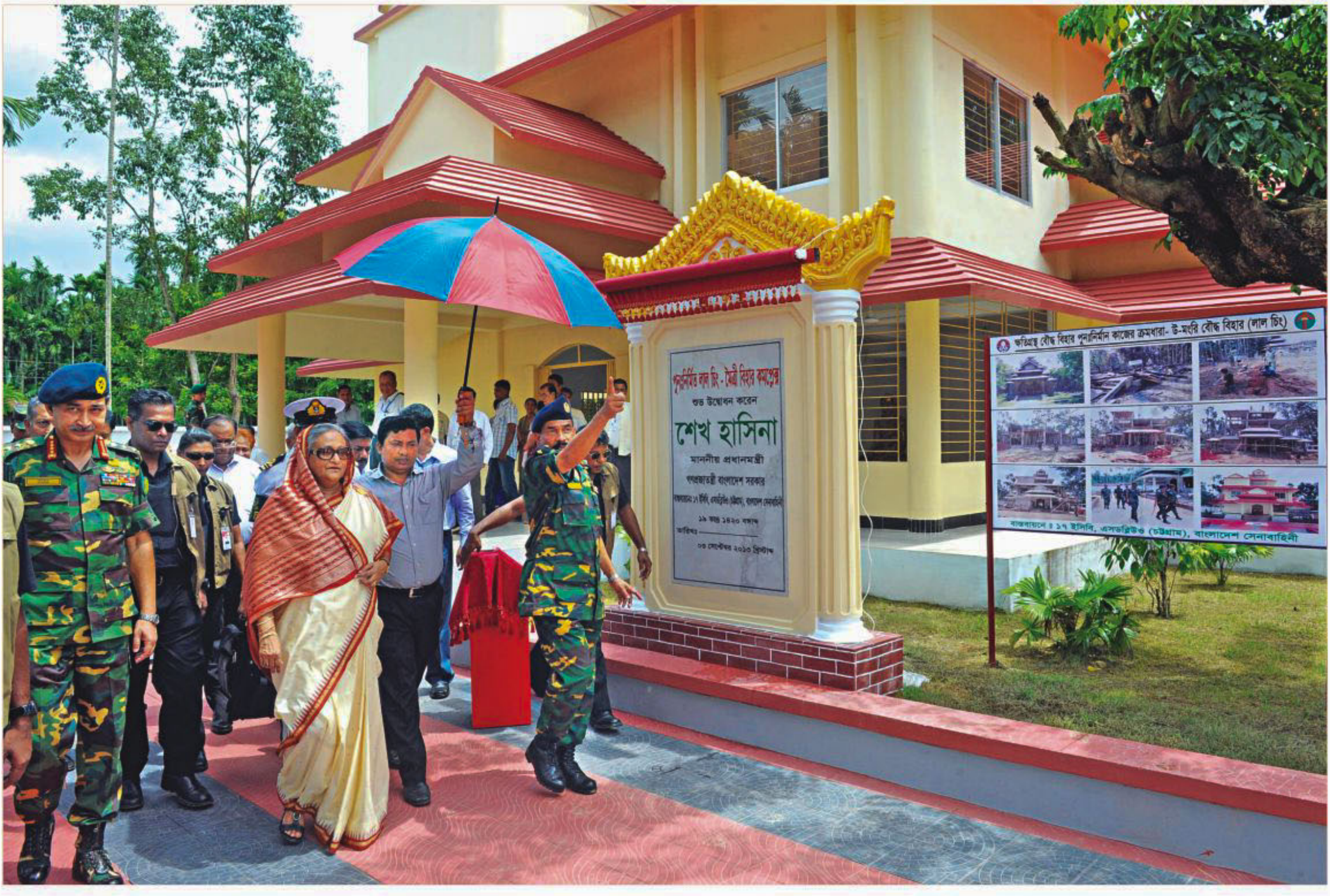
Prime Minister Sheikh Hasina departs the premises of the newly reconstructed Lal Ching-Moitree Bihar Complex after inaugurating the Buddhist monastery in Ramu upazila of Cox's Bazar yesterday.