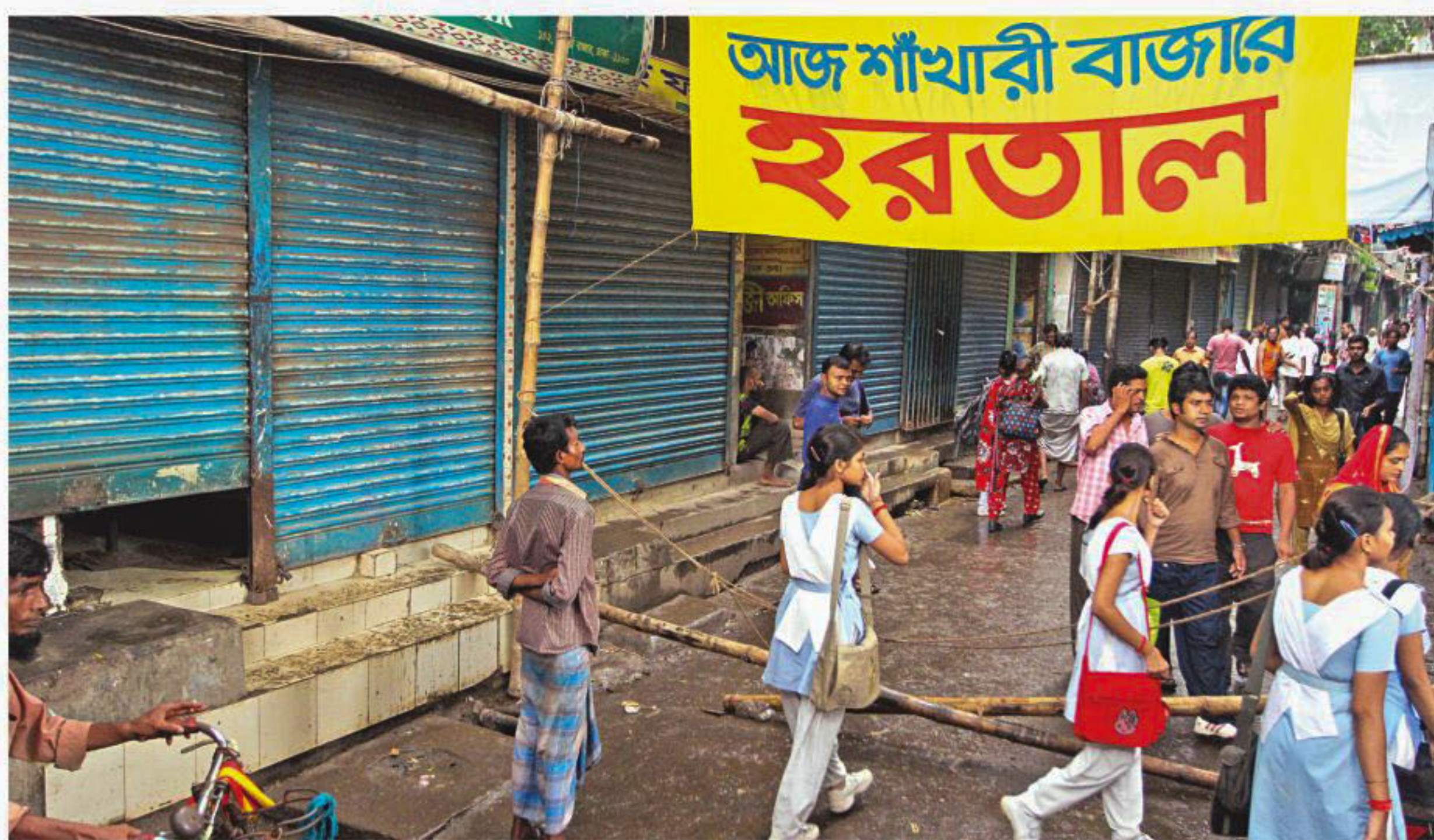
A banner at Shankhari Bazar in Old Dhaka reads in Bangla: "Today is hartal at Shankhari Bazar", the shops remaining shut. An organisation of land owners observed the hartal yesterday after Rajdhani Unnayan Kartripakkha (Rajuk) declared the area a heritage site.