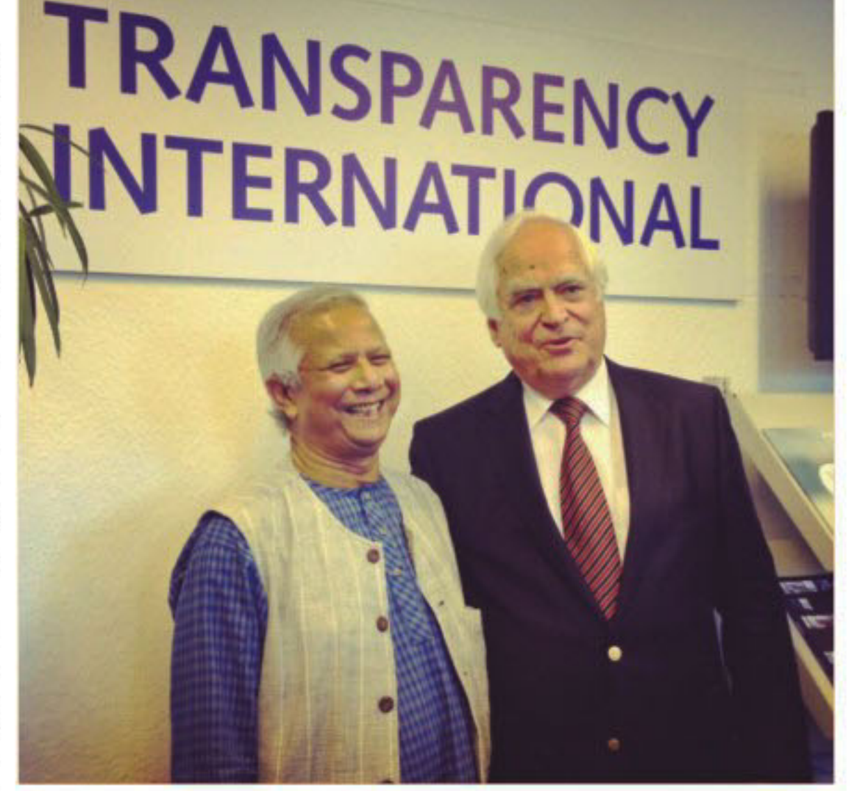
Nobel laureate Prof Muhammad Yunus with Transparency International founder Peter Eigen in Berlin.

Nobel laureate Muhammad Yunus has proposed an international minimum wage for garment workers to be worked out for each country separately, as part of a global effort to solve labour issues in all garment producing nations. The wage, he said, should be accepted as a compliance issue, and should not be a subject of any price negotiation. International buyers will accept it as part of production cost and make sure price negotiation should not impact on this wage in any country, Yunus said. Prof Yunus spoke at a preparatory conference at the Humboldt-Viadrina School of Governance in Berlin on Thursday to address the issues raised in Bangladesh after the Rana Plaza tragedy. The Humboldt-Viadrina School of Governance also organised a global conference to launch Garment Industry Transparency Initiative (GITI) at Yunus's suggestion.