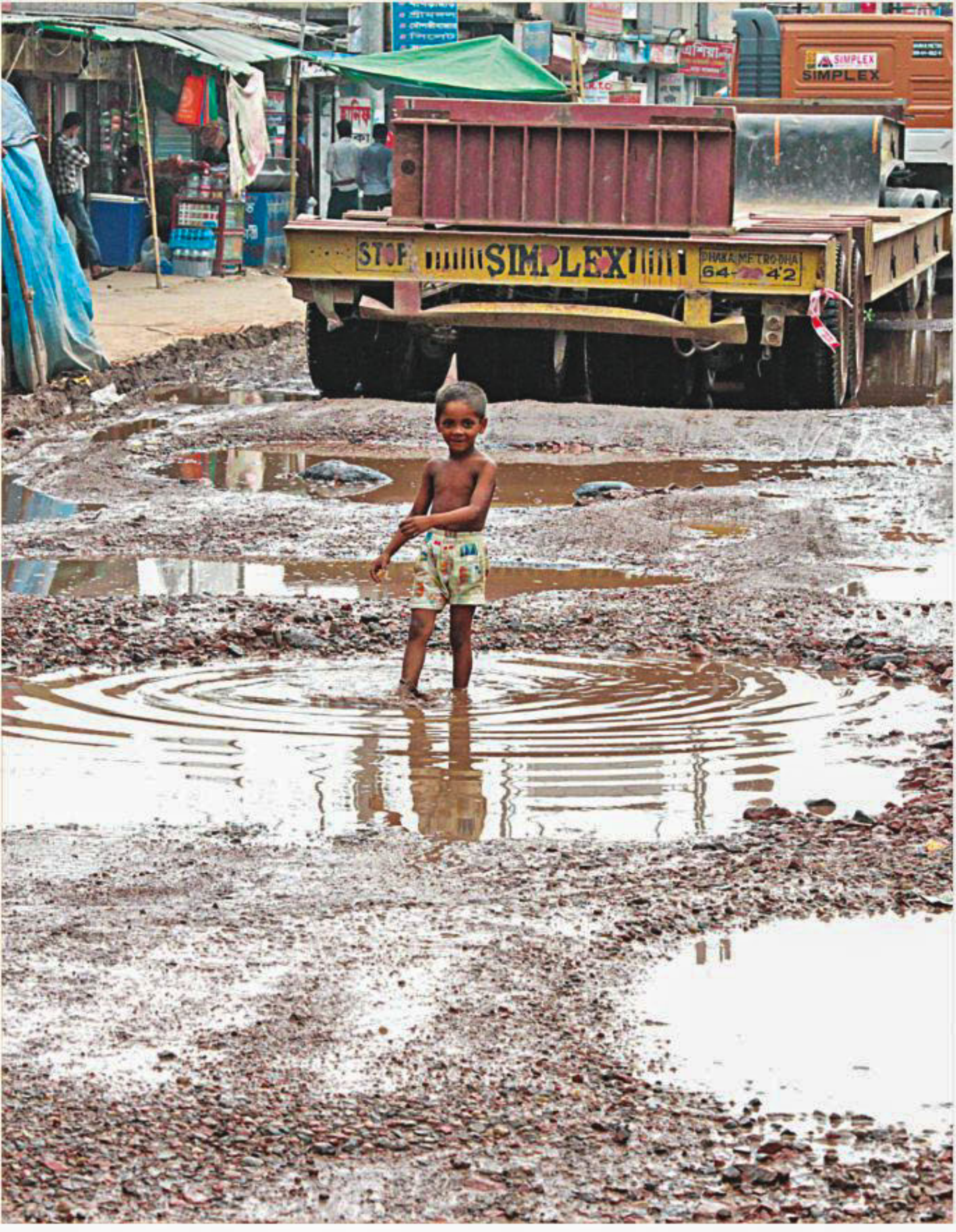
Muddy water collects on craters, created following the movement of heavy vehicles working on the construction of a flyover, on this road near RK Chowdhury University College in the capital's Sayedabad. The photo was taken yesterday.