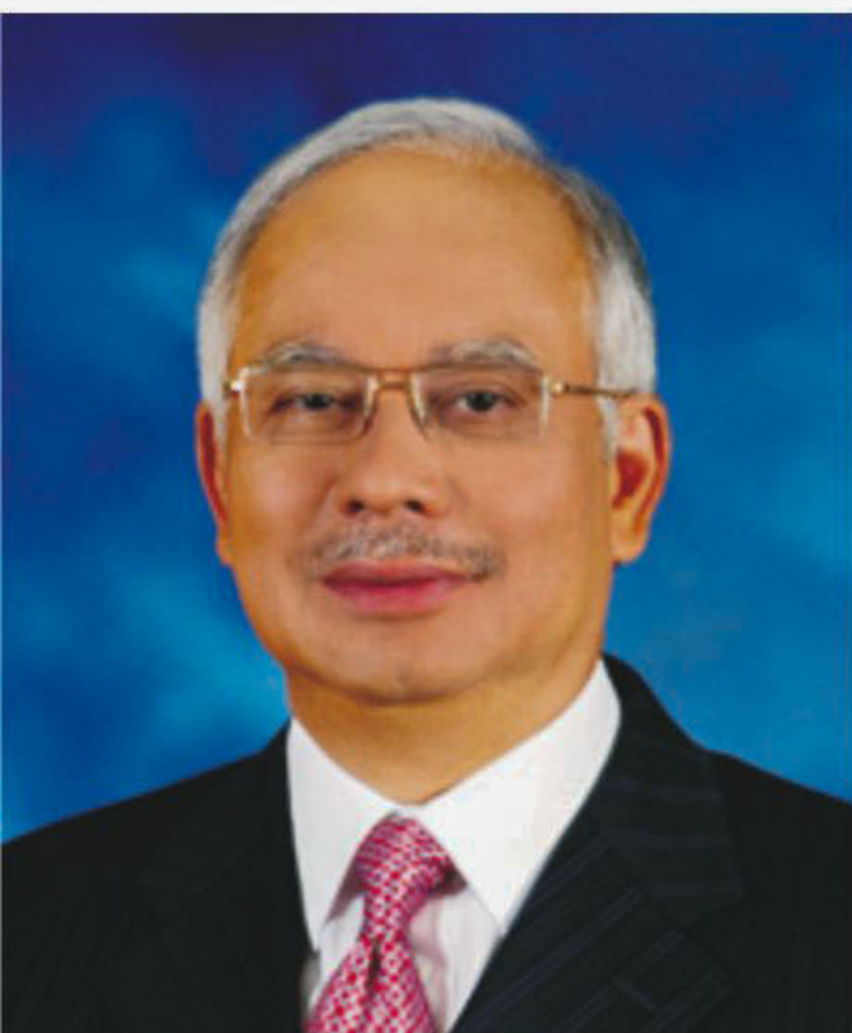
Dato' Sri Mohd Najib bin Tun Haji Abdul Razak Prime Minister of Malaysia