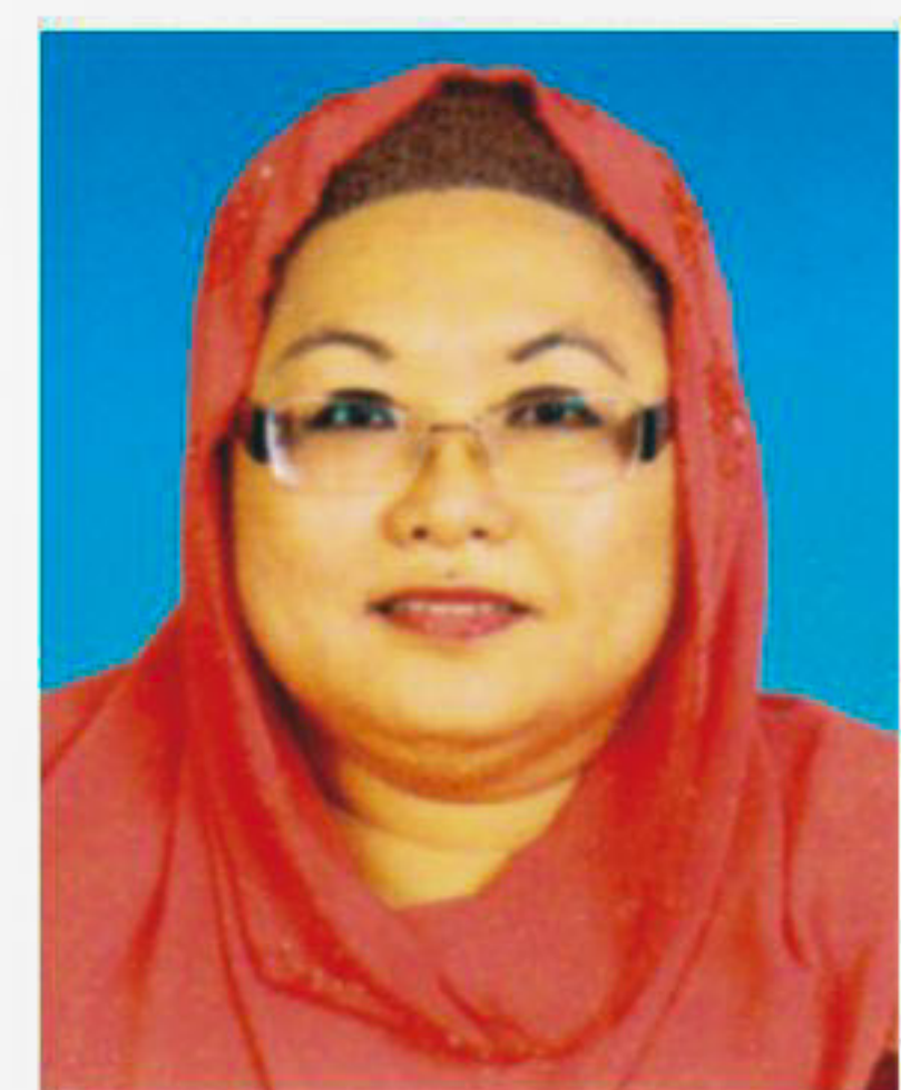
Norlin Binti Othman High Commissioner of Malaysia to Bangladesh