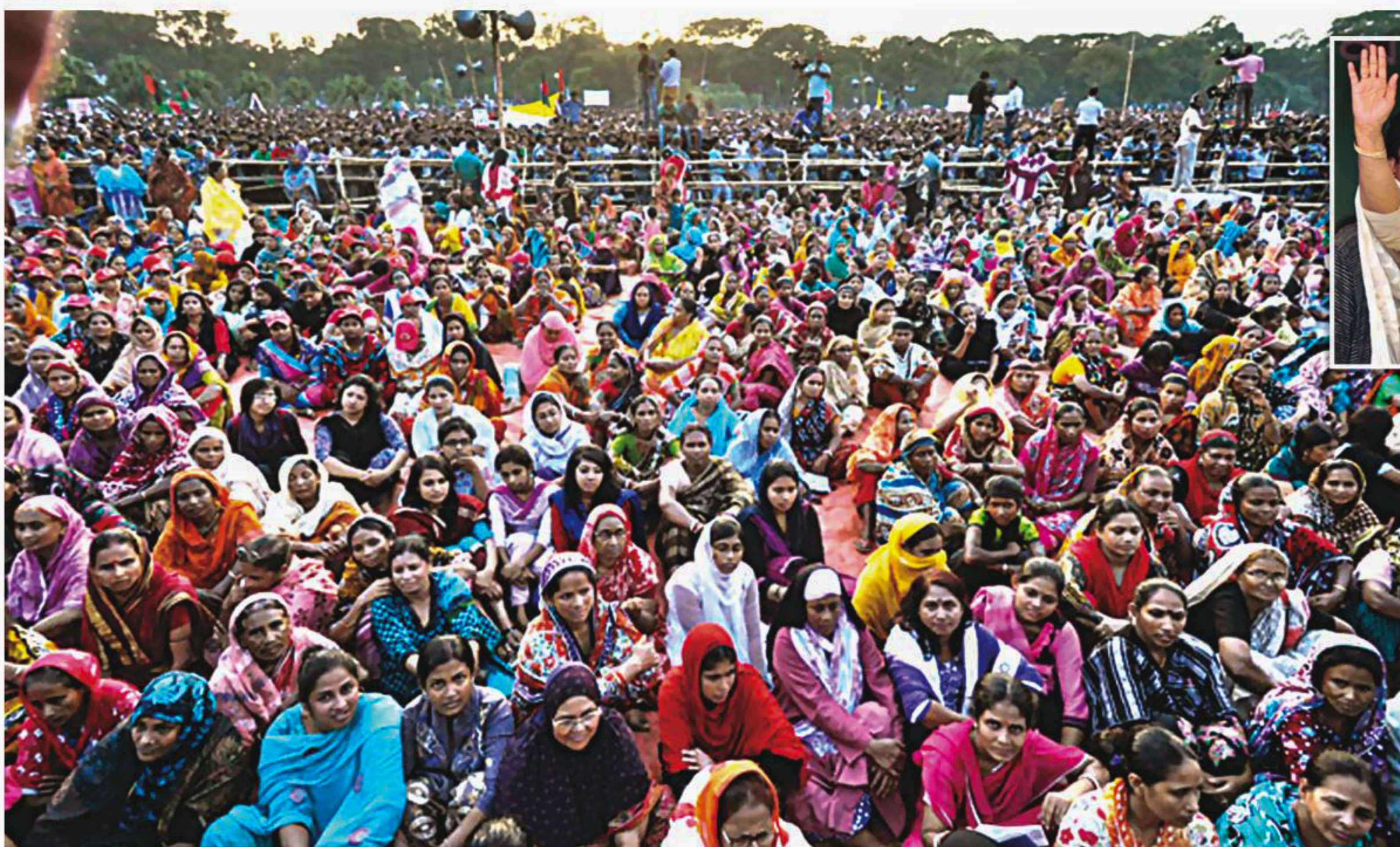
Part of the crowd at an Awami League rally in the historic Suhrawardy Udyan yesterday. Prime Minister and Awami League chief Sheikh Hasina, inset, waves to the crowd.