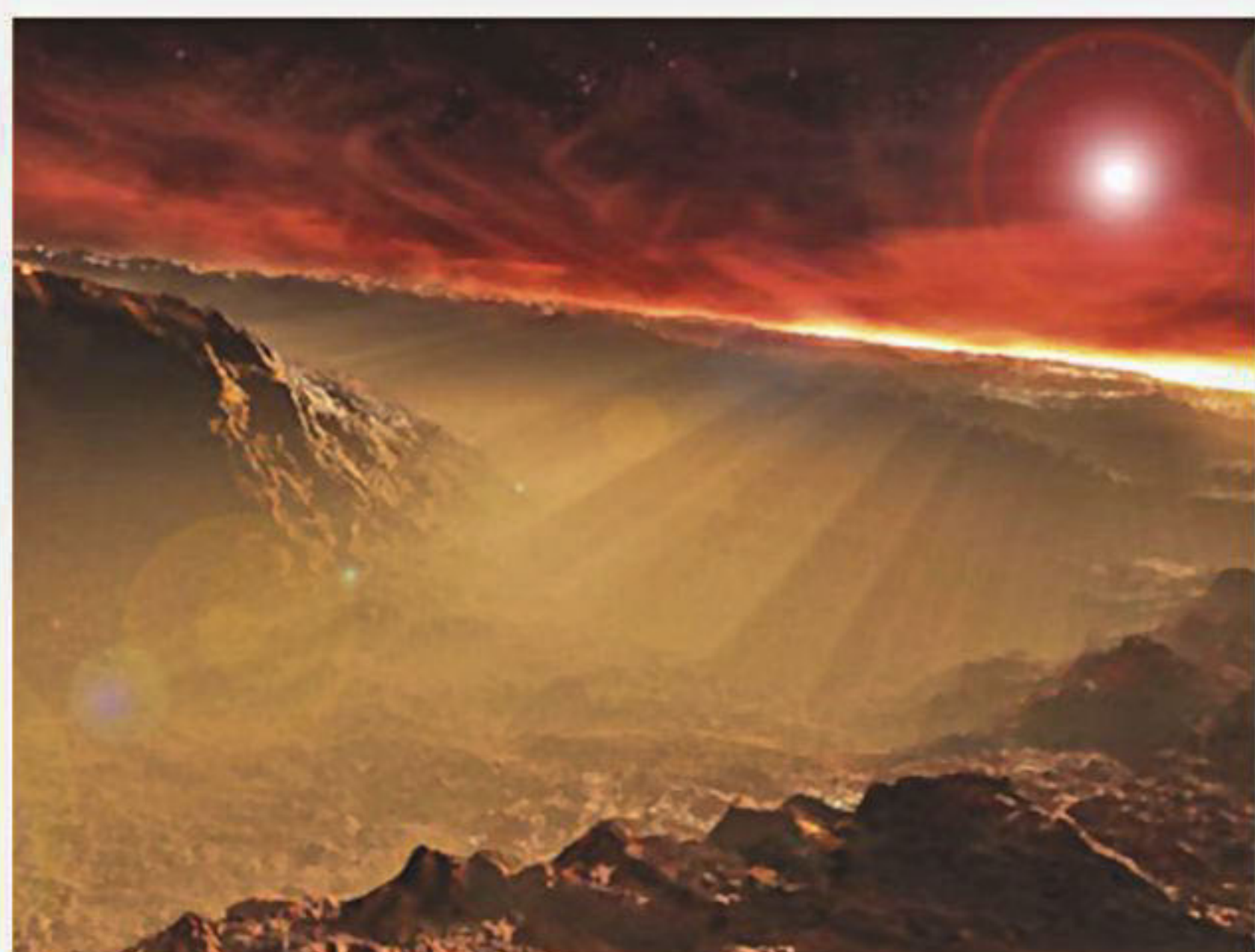
Sunrise over the Gale crater on Mars. Was this where life began?