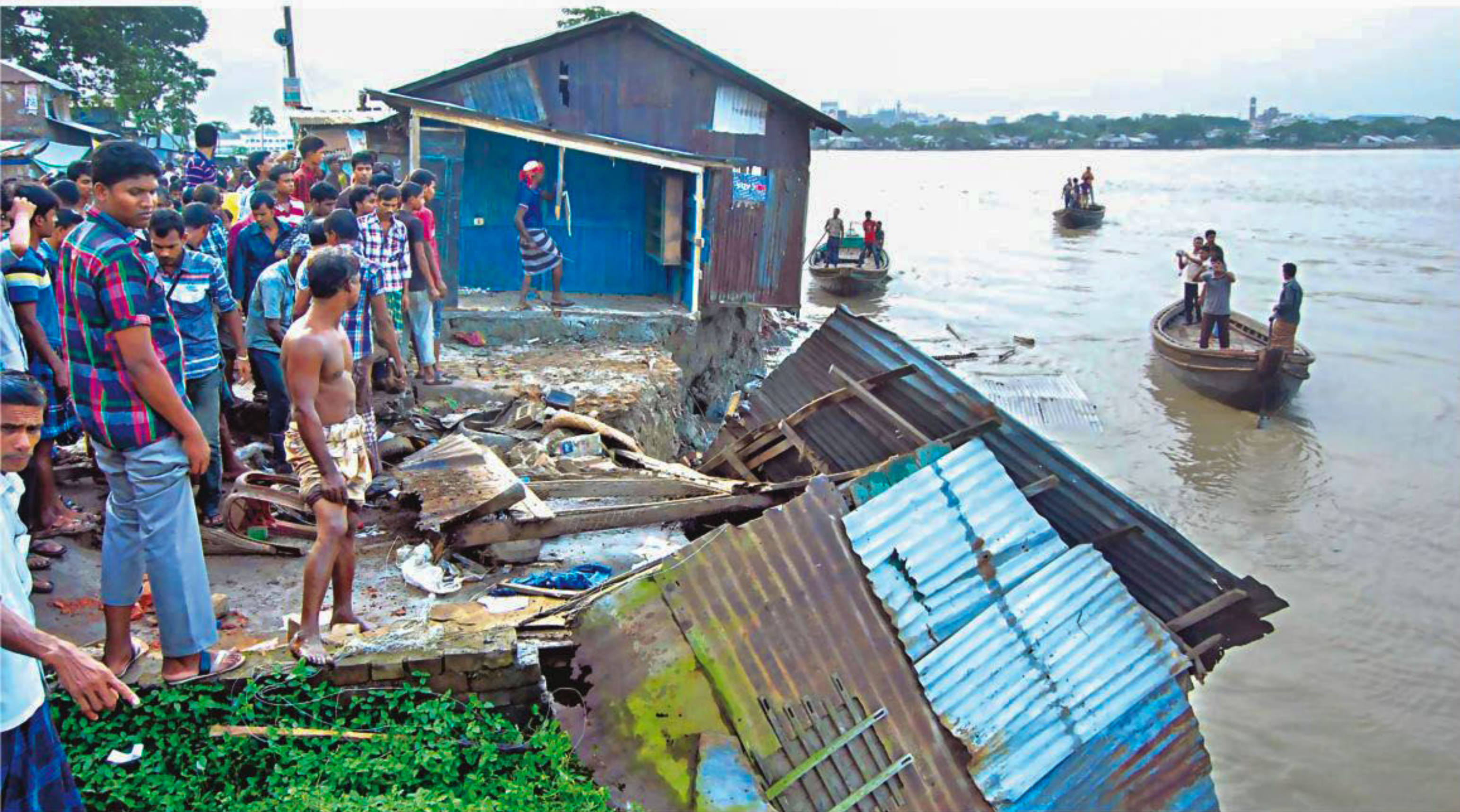
People can do nothing but watch as the mighty Kirtonkhola devours a shop at Charkawa Bus Station in Barisal yesterday. The river erosion took at least 50 structures, two homes and 48 shops, in just one day.