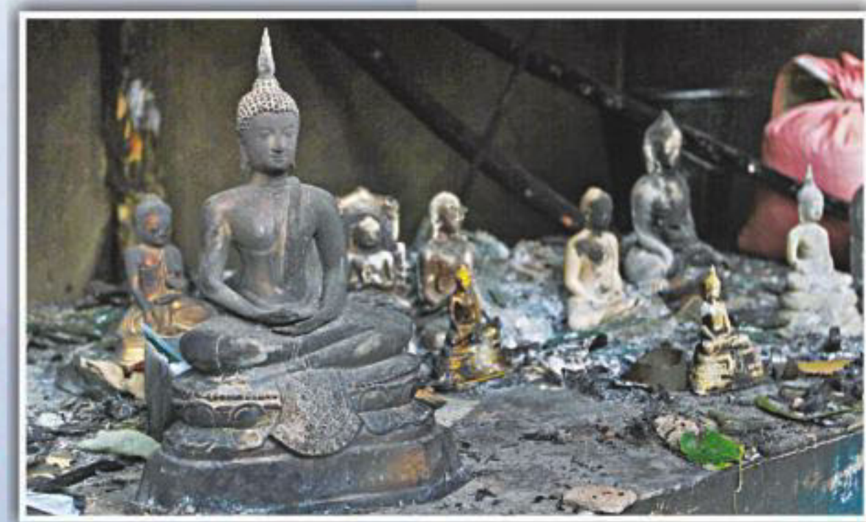
The Bimukti Bidarshan Bouddha Bihar, left, in Ramu of Cox's Bazar which was rebuilt after Islamist fanatics, instigated by a certain political party, had burnt it last year. Several Buddhist temples were damaged, destroyed and burnt to the ground in the attack. Inset, a file photo of the charred Bouddha Bihar.