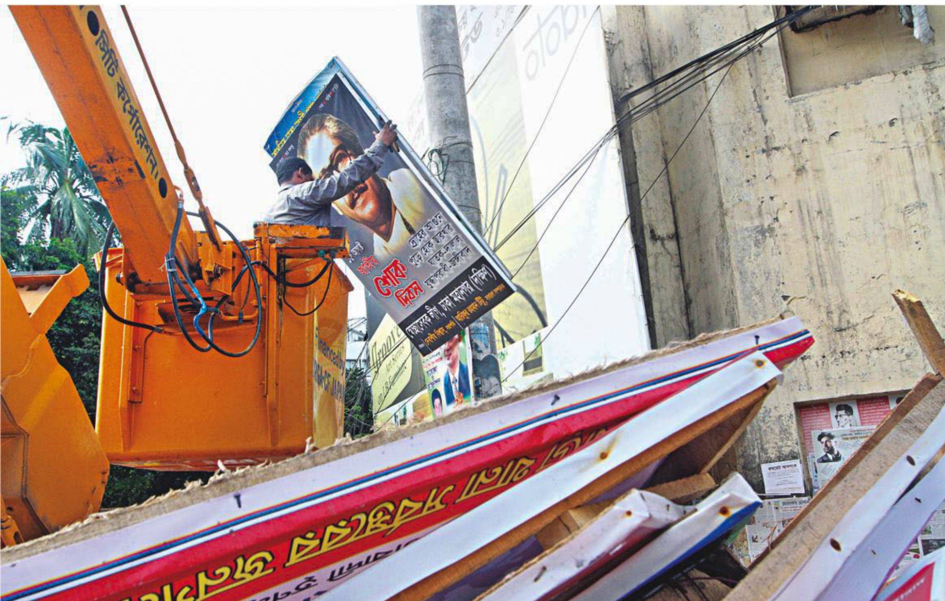
Dhaka South City Corporation removes unauthorised placards and banners from in front of Jatiya Press Club in the capital yesterday. The move came after a recent spike in placards and banners littering Dhaka, mostly put up by political leaders.