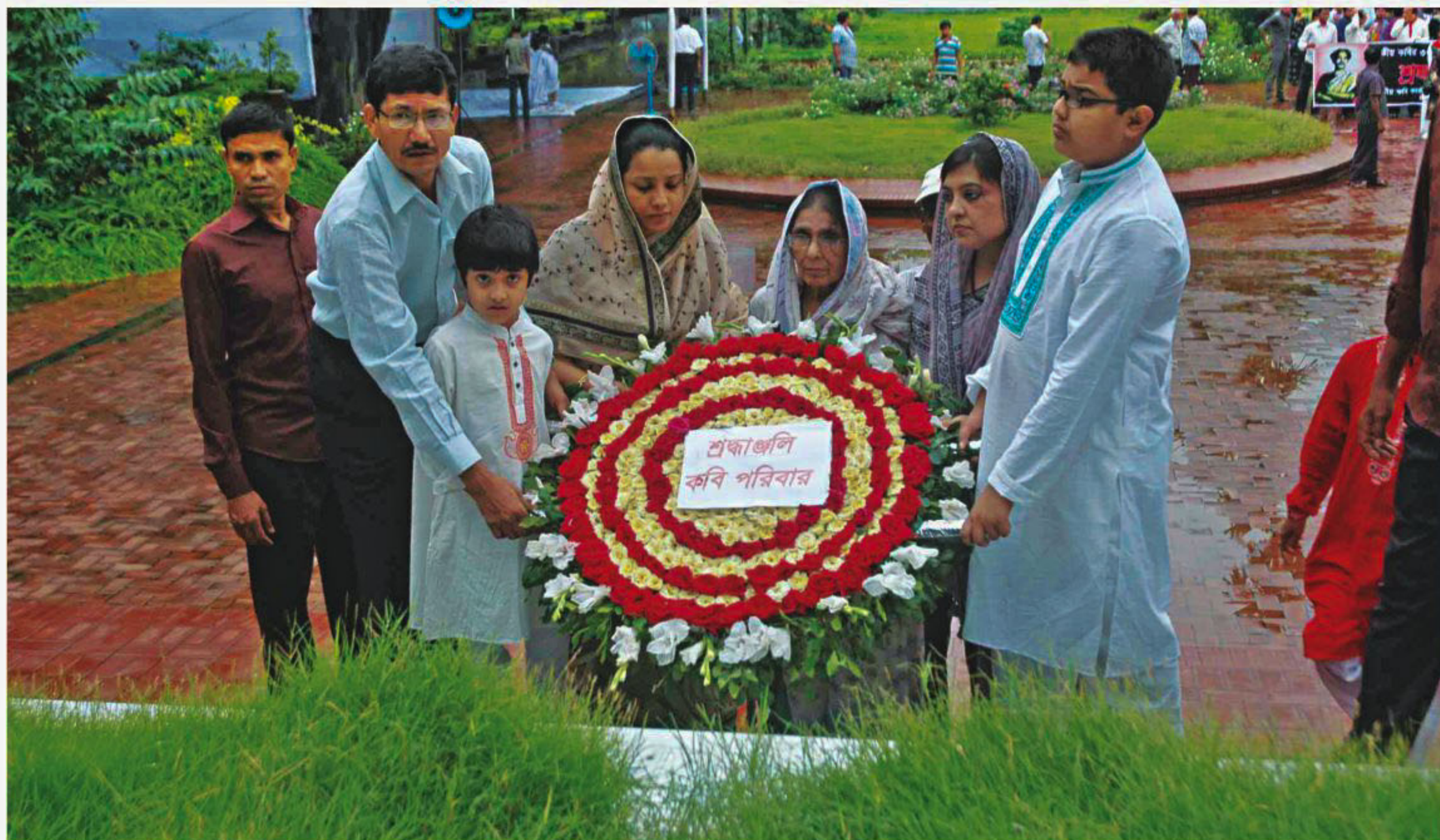
The family of National Poet Kazi Nazrul Islam placing a wreath on his grave on Dhaka University campus marking his 37th death anniversary yesterday.