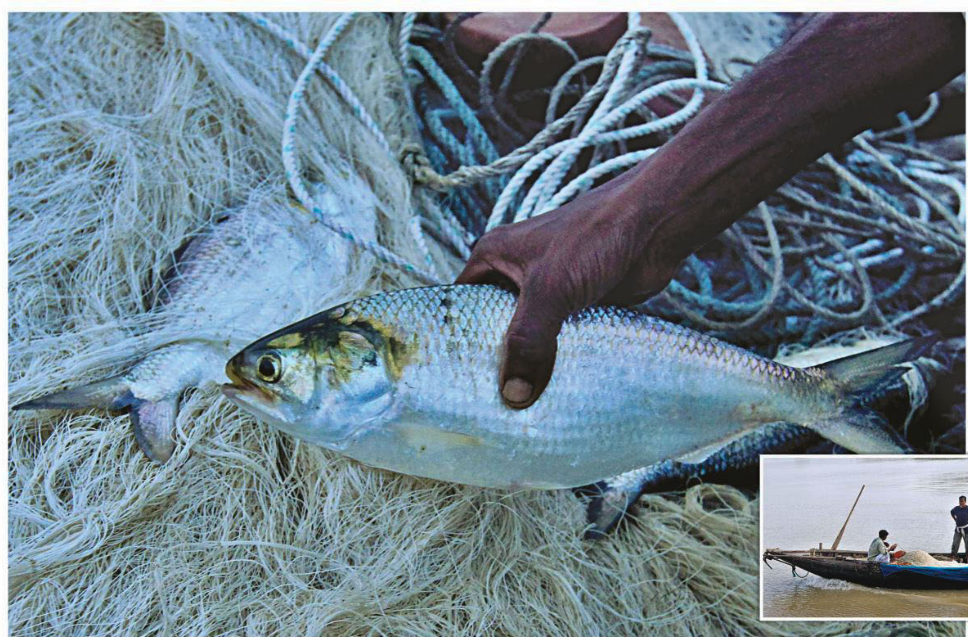
Inset, fishermen try to catch hilsa in the Pasur river in Mongla, Khulna. There was a time when they used to catch 40-50 fish at one go but nowadays they catch 4-5 fish despite using the banned current nets. They blame the river losing depth for their poor catch. The photos were taken last week.