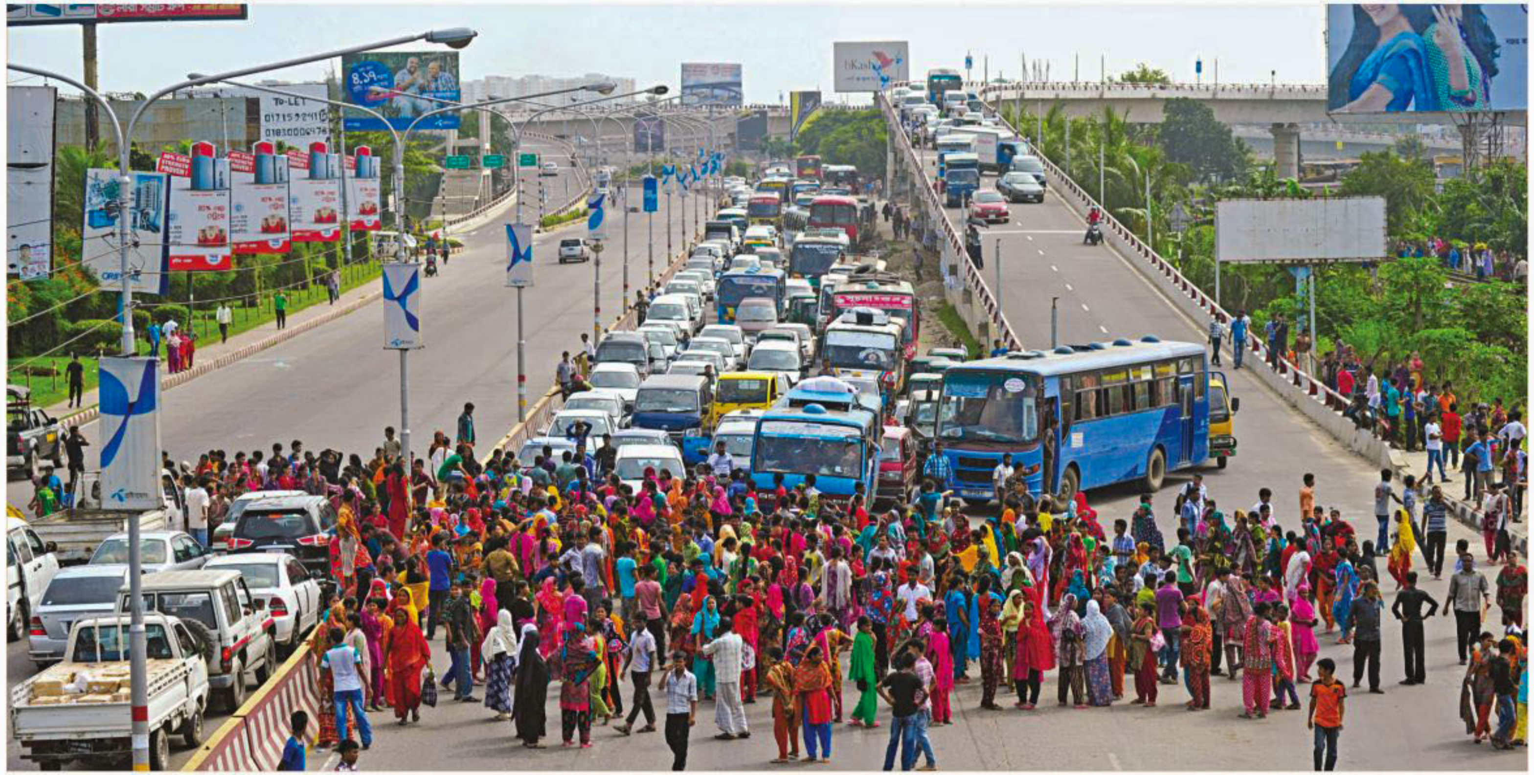
Garment workers block the busy Airport Road near Kuril flyover in the capital around 10:00am yesterday demanding benefits. This resulted in a traffic jam that lasted an hour and a half.