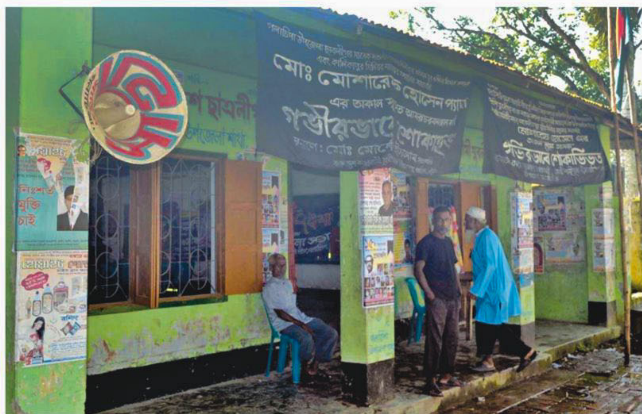
The photo on the left shows how the local Awami League had turned the classroom of Galachipa Secondary Model School in Patuakhali into a party office, allegedly with ruling party lawmaker Golam Maula Rony's influence. The photo was printed in The Daily Star on its August 20 issue and following the media attention, the party office was removed after two and a half years and the school authorities were yesterday seen, right, cleaning up the room for holding classes again.