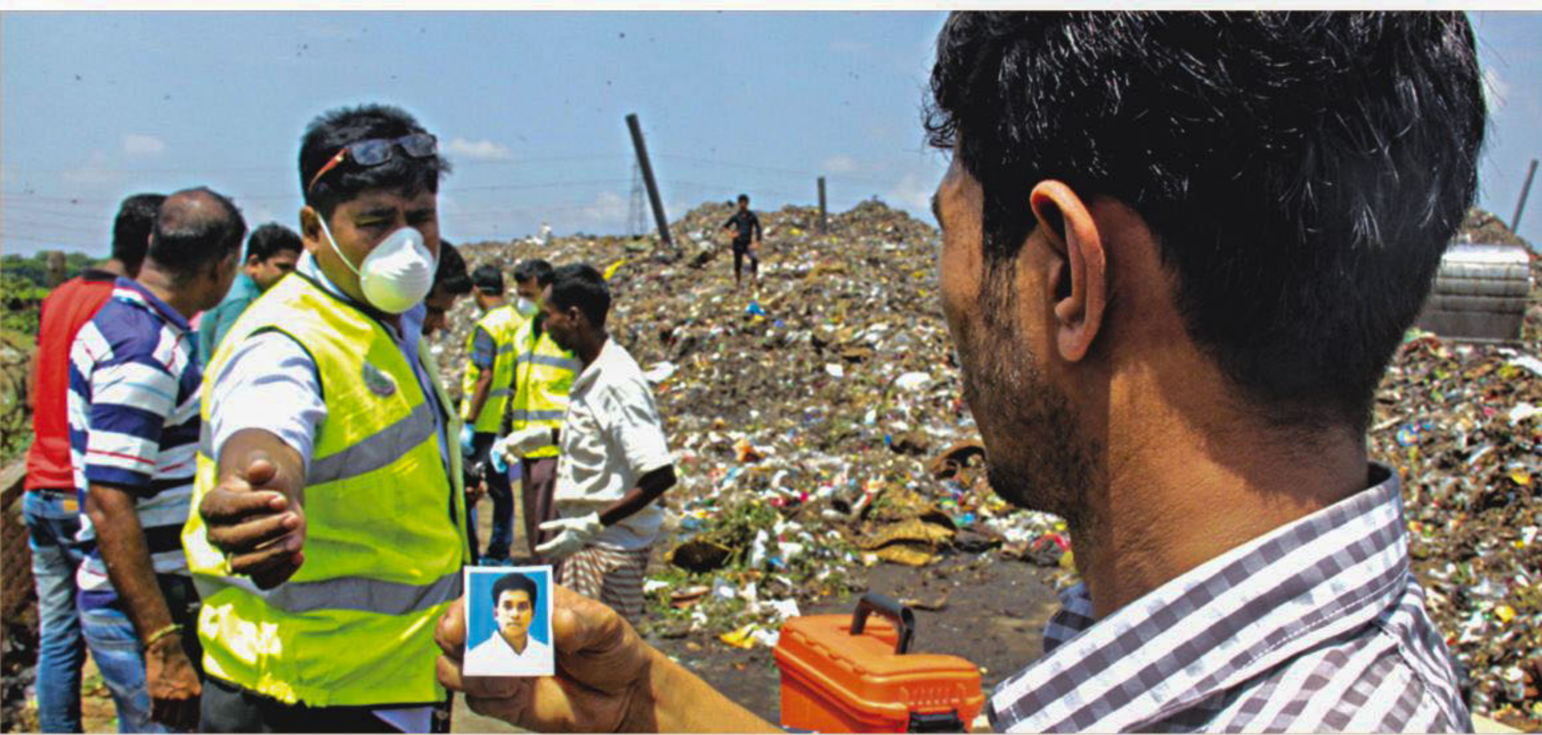
A man rushes to the Matuail landfill in the capital with the photo of a relative who has been missing for 18 days when the police were recovering 16 body parts and 13 bones that were discovered there.