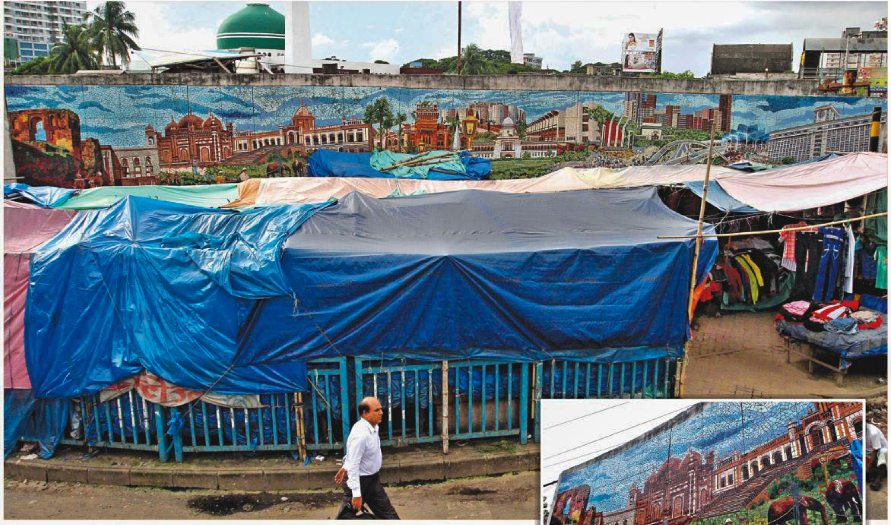
The beauty of the mural, depicting the rich heritage of Dhaka, on the eastern wall of New Market can hardly be seen as hawkers set up shops on the adjacent pavement.