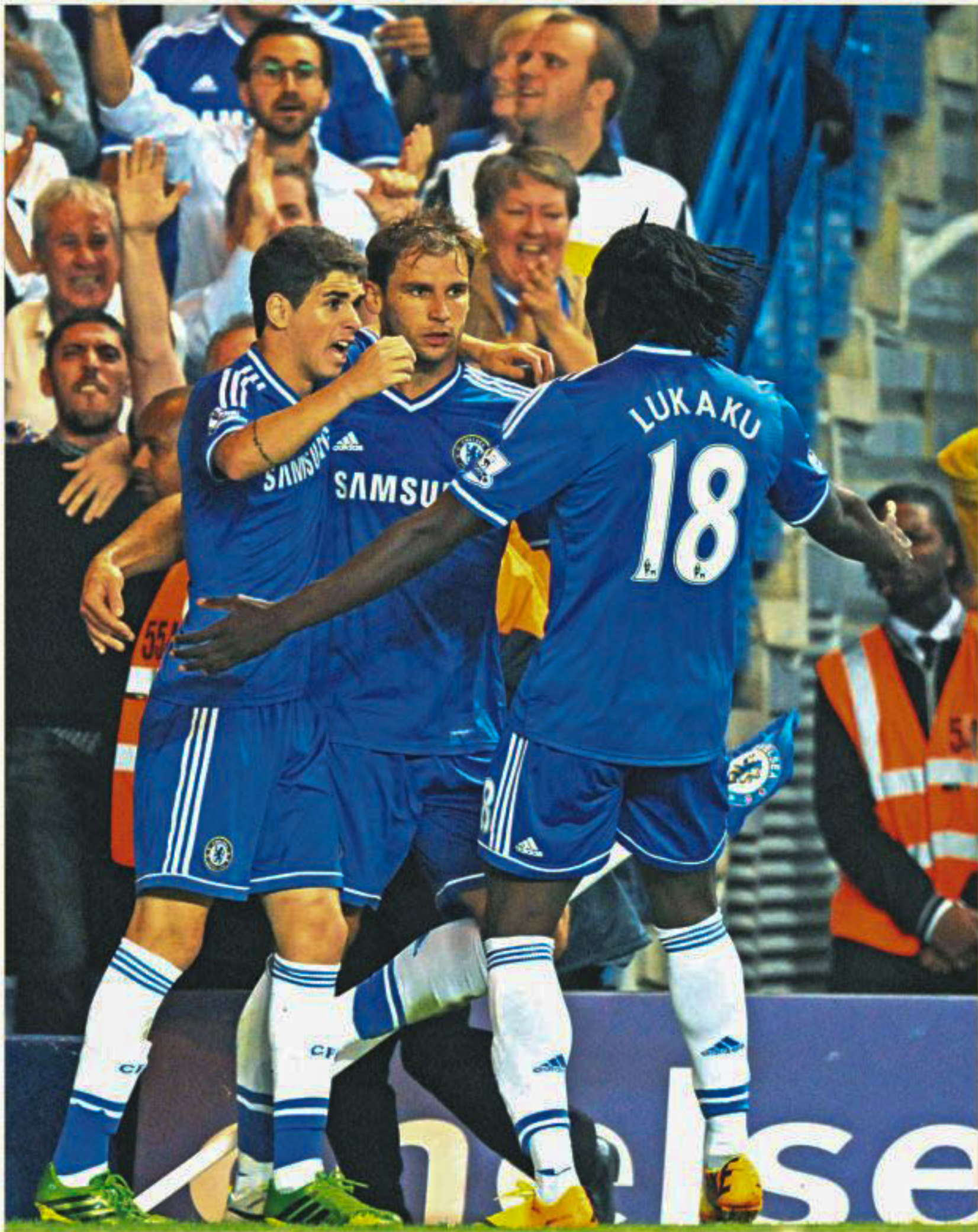
Chelsea full-back Branislav Ivanovic (C) celebrates his winning goal with teammates Oscar (L) and Romelu Lukaku during their Premier League clash against Aston Villa at Stamford Bridge on Wednesday.

Oscar released Eden Hazard with an incisive pass down the inside-left