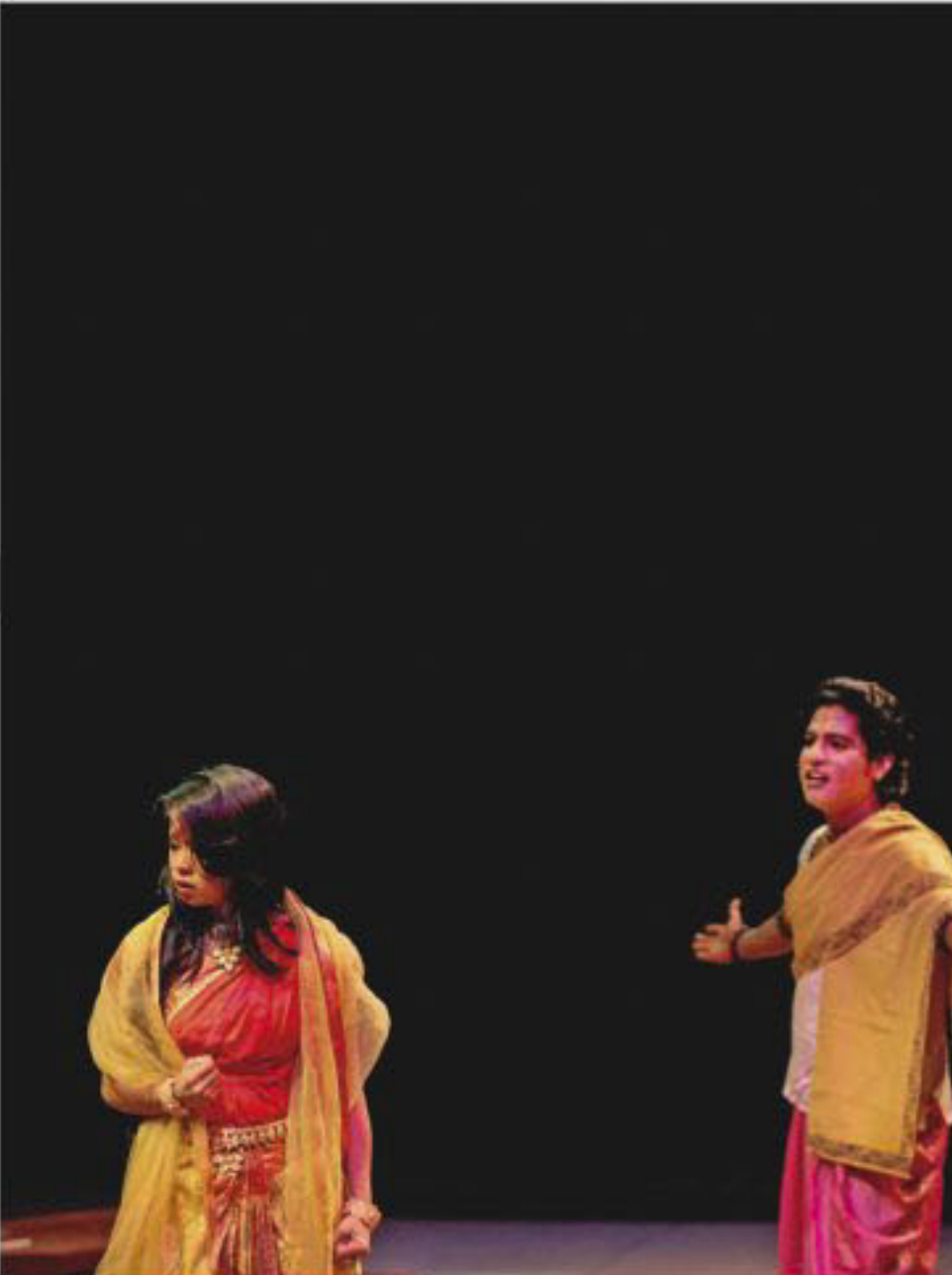
Scenes from "Ami Birangona Bolchi" (L) and "Chitrangada".