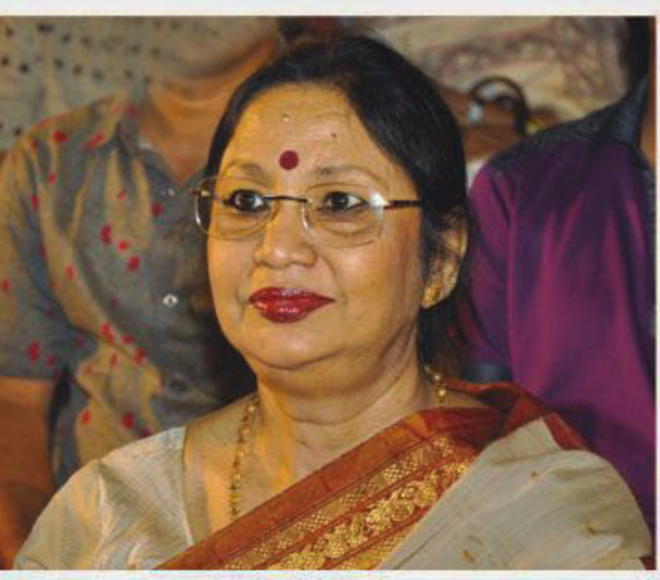
Nowadays, I get agitated quickly and get tense over trivial matters.

What is the worst thing about you? I take great interest in designing saris for myself. In doing so, I find that our deshi materials are fun to work on. I also love to experiment with new dyes at regular intervals. In addition, I am into interior designing.