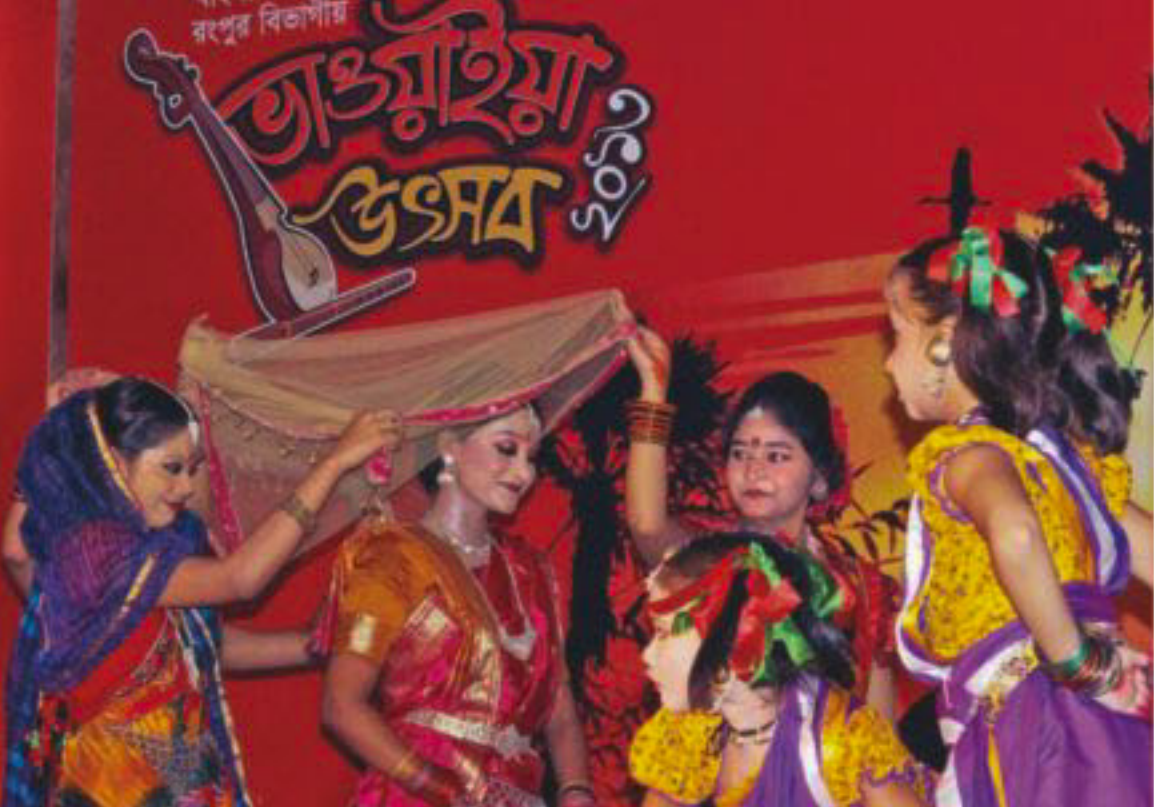
Dancers perform at the programme.