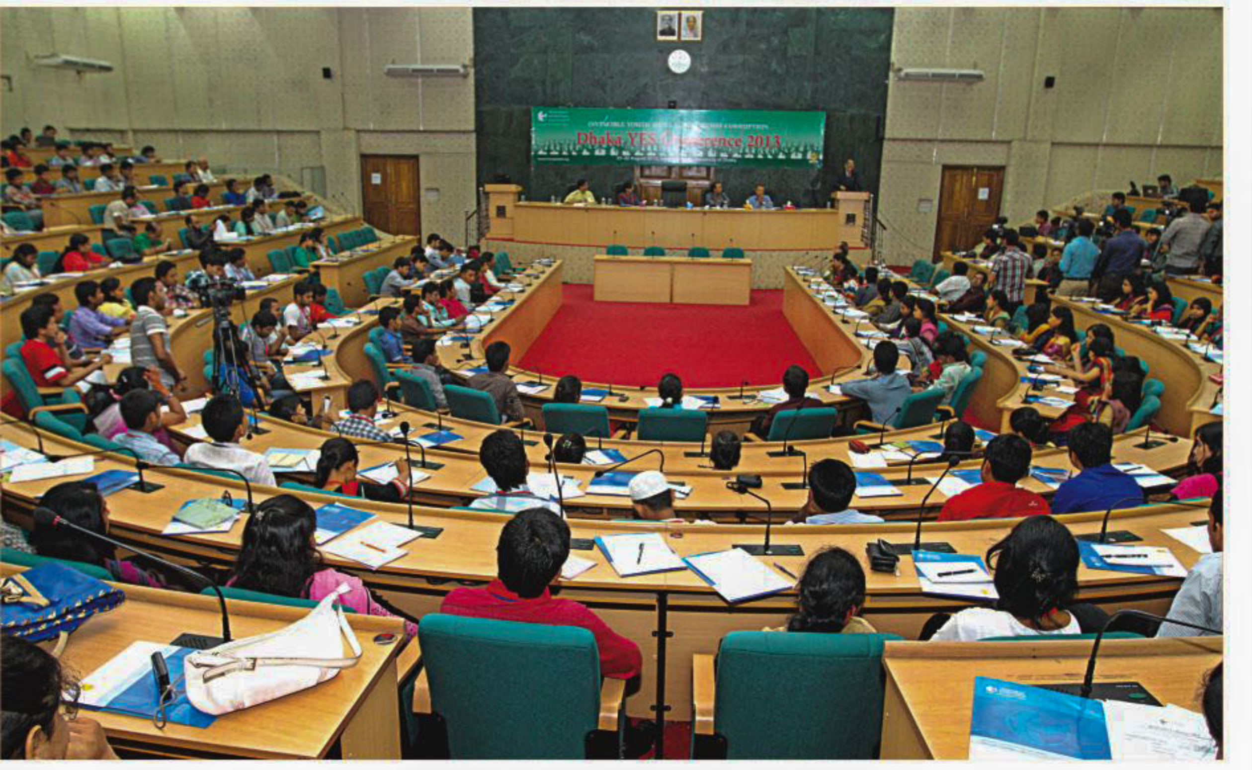
Participants at the inaugural ceremony of the two-day Dhaka YES Conference 2013 at Nabab Nawab Ali Chowdhury Senate Bhavan of Dhaka University yesterday. Transparency International, Bangladesh organised the conference to sensitise the young people to TIB's anti-corruption movement. Story on page 3.

"This cannot be possible without active connivance, nexus and collusion of government officials in Delhi or at borders," he said.