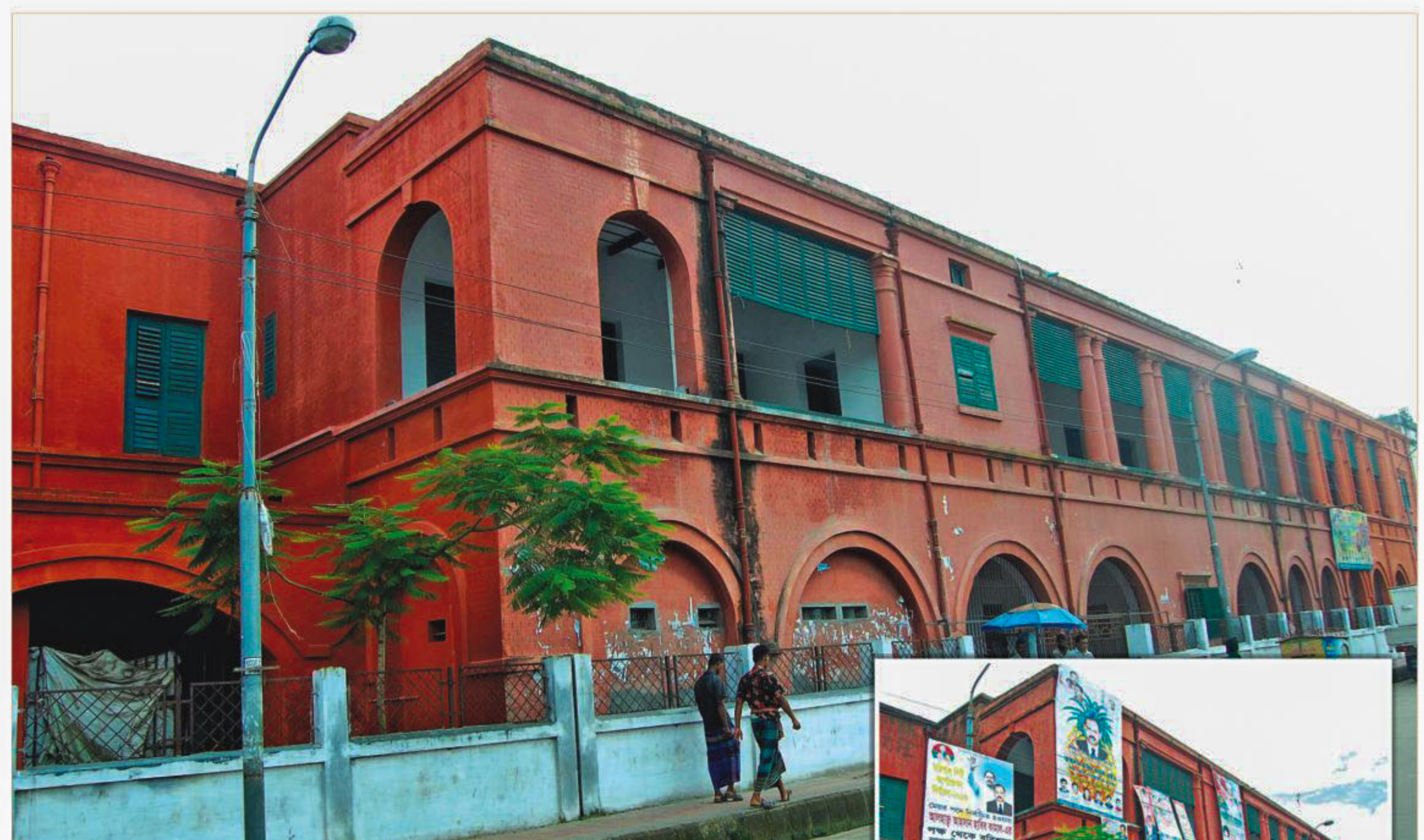
Barisal Museum after the Barisal City Corporation authorities cleared its facade of unauthorised banners and festoons yesterday. The move came after The Daily Star published the inset photo on Monday. Defying a BCC ban, the banners and festoons were put up for greeting the new city mayor, whose office, the BCC Bhavan, stands just across the street from the museum.