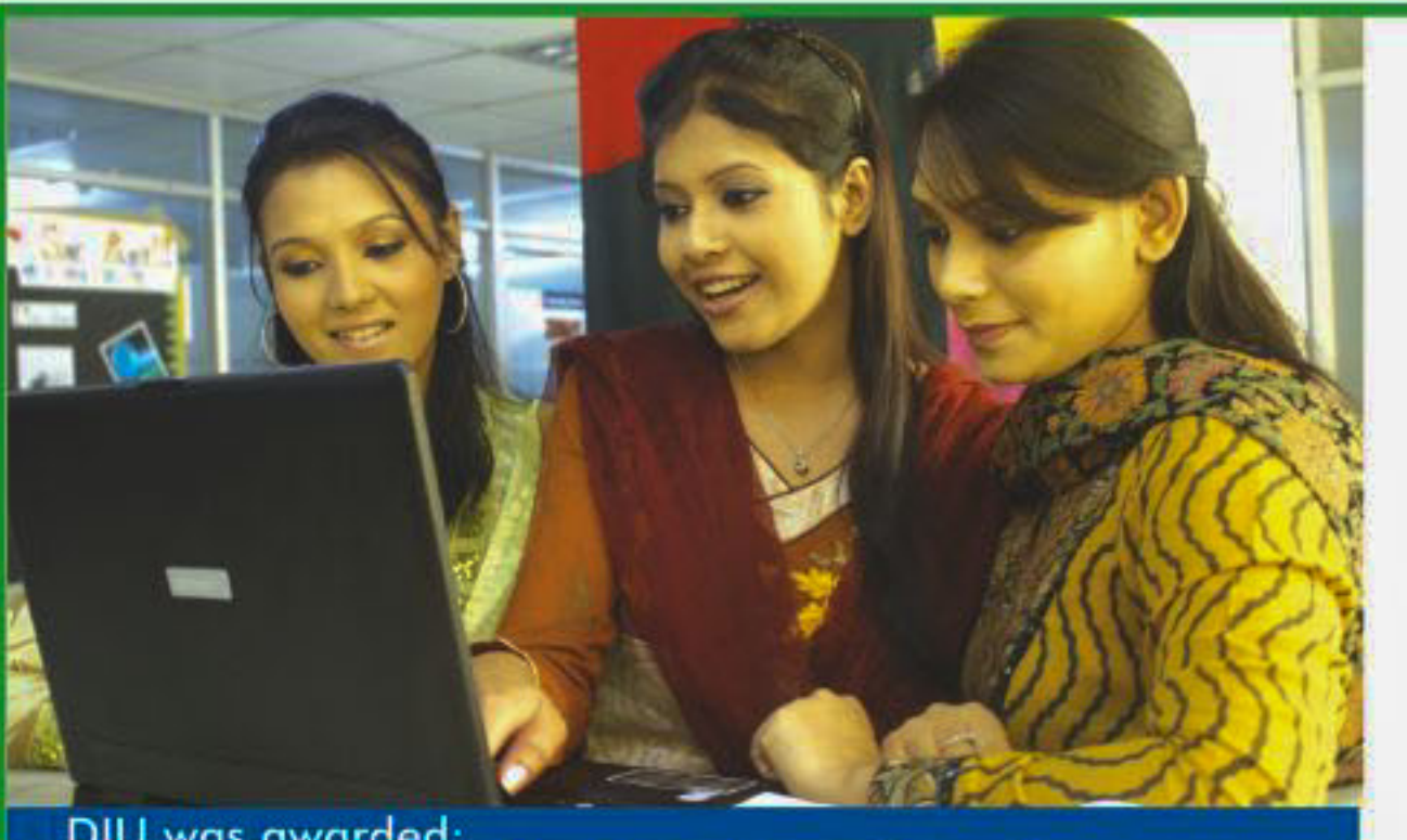
DIU was awarded: "Amity Global Academic Excellence Award"

Charge sheets of the two cases, one for smuggling firearms and the other under the arms act, accused 50 and 52 persons respectively.