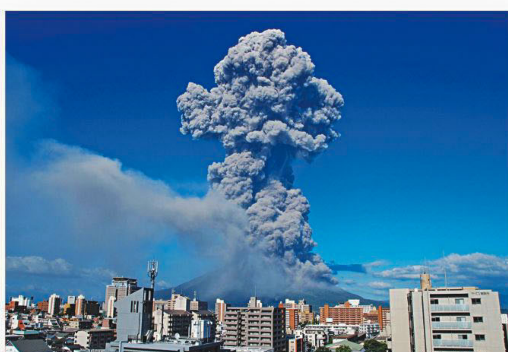
The picture shows smoke rising from the 1,117-meter Mount Sakurajima at Kagoshima city in Japan's southern island of Kyushu yesterday. The volcano erupted an ash plume up to 5,000 metres into the air. It was the 500th eruption this year of Sakurajima, which is about 950 kilometres southwest of Tokyo.