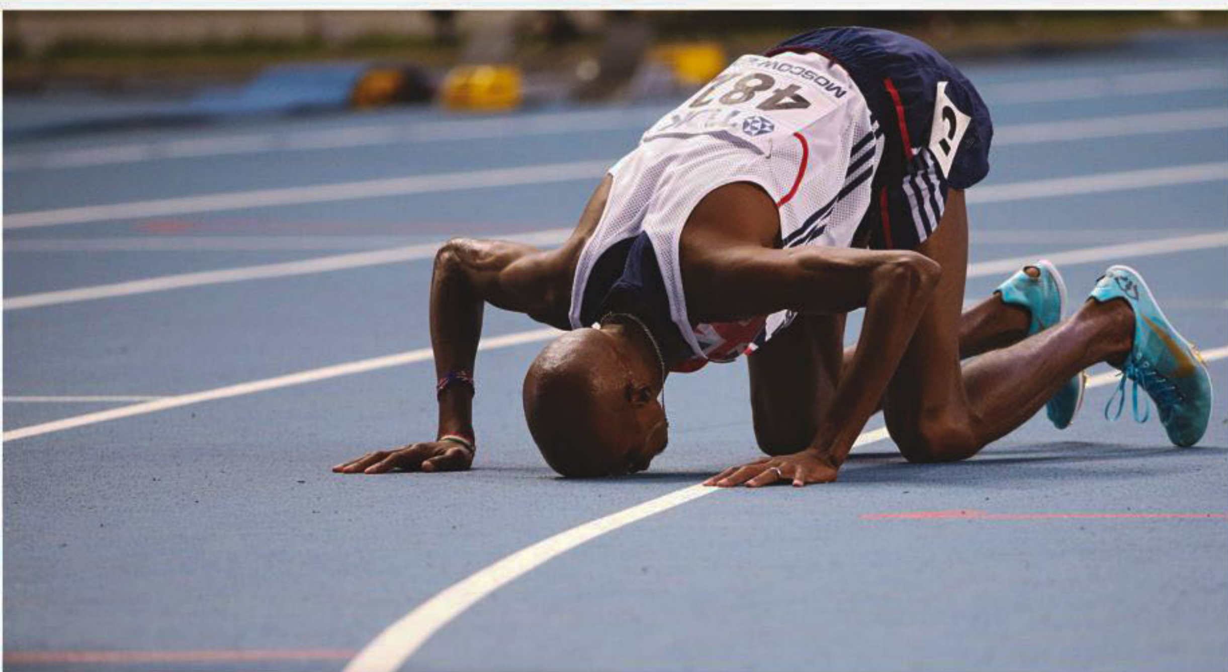
Great Britain's Mo Farah kisses the track in celebration of his 5000 metres final victory during the IAAF World Championships at the Luzhniki Stadium on Friday.

Saturday also witnessed a moment of history, with Hawk-Eye used to determine that shots in the games at Anfield and the Emirates had not crossed the line in the first ever uses of goal-line technology in a domestic league.