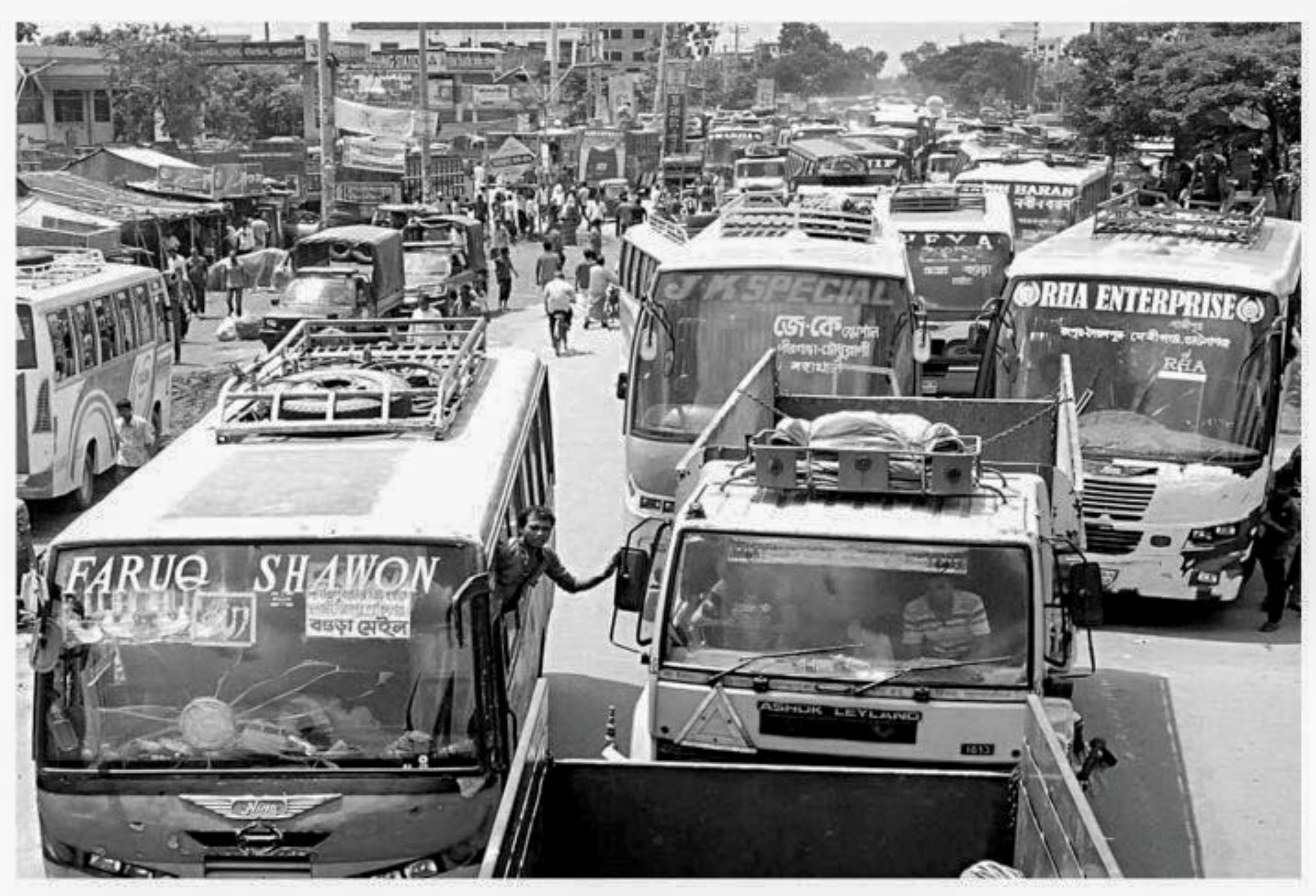
Transport workers block the road at Charmatha intersection in Bogra town for two hours from 10:30am yesterday protesting the beating up of a Bogra-based transport worker at Bypail in Dhaka and alleged rampant extortion by police.