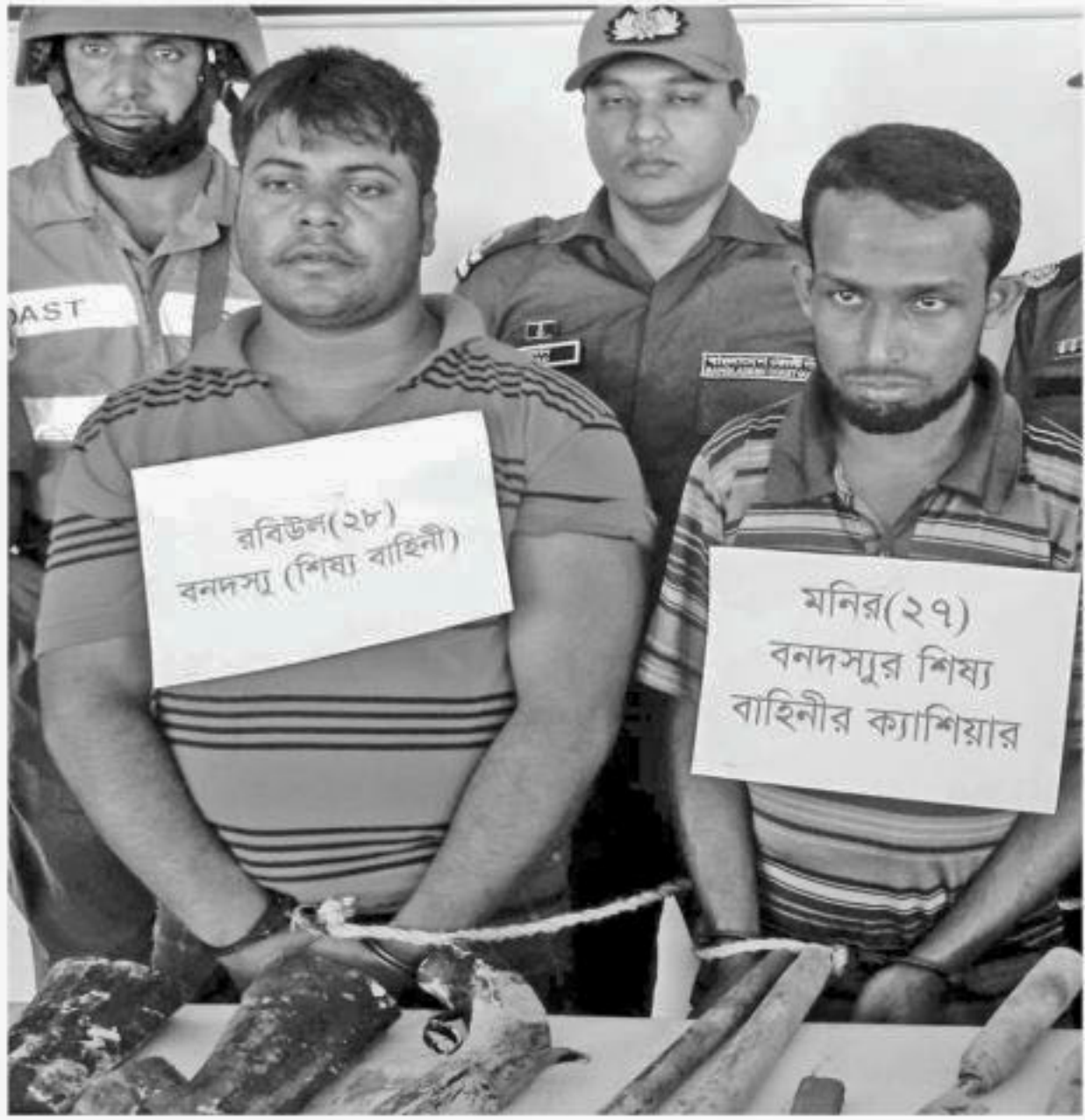
Two forest robbers, arrested with arms and ammunition after a gunfight with coastguards in the Sundarbans early yesterday, are at Koira Police Station in Khulna district.

Police also recovered one of the four trawlers looted