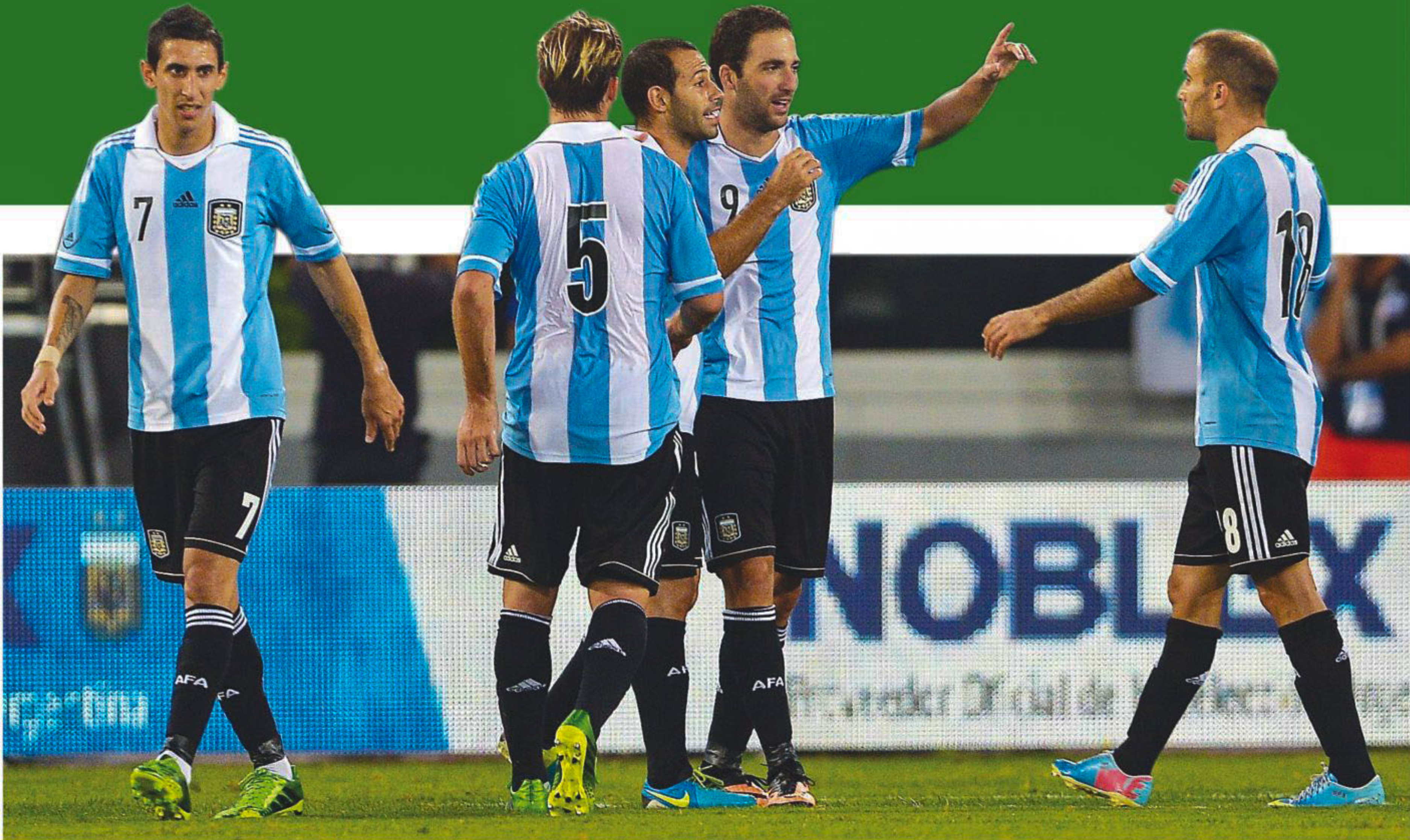
Argentina striker Gonzalo Higuain (2nd from R) celebrates his goal with teammates during their international friendly against Italy at the Olympic Stadium in Rome on Wednesday.