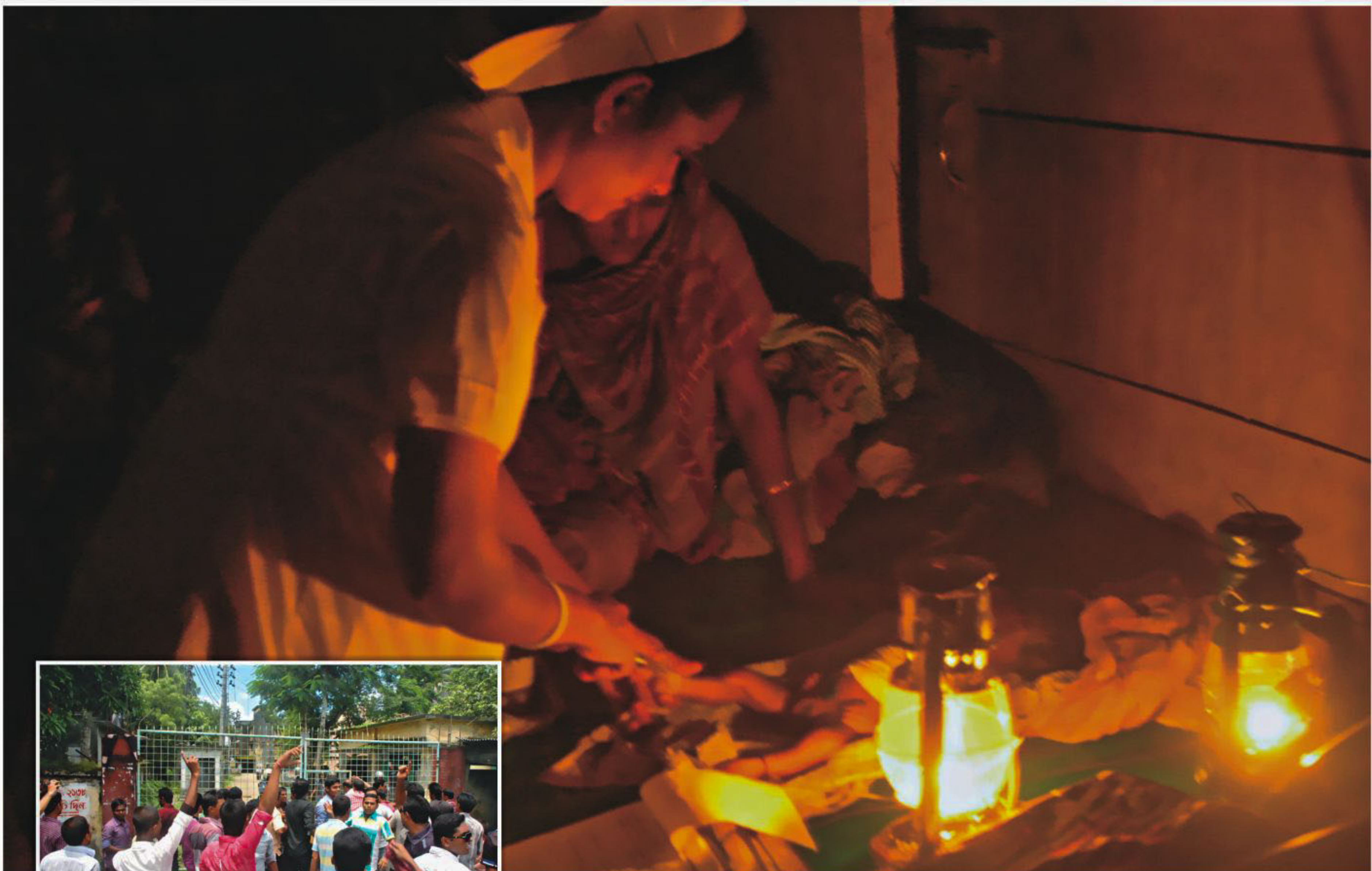
A nurse gives injection to a baby in the dim light of hurricane lamps at a Bhola hospital yesterday. Inset, people, angered by the four-day power outage, agitate at the gate of Bhola PDB office.