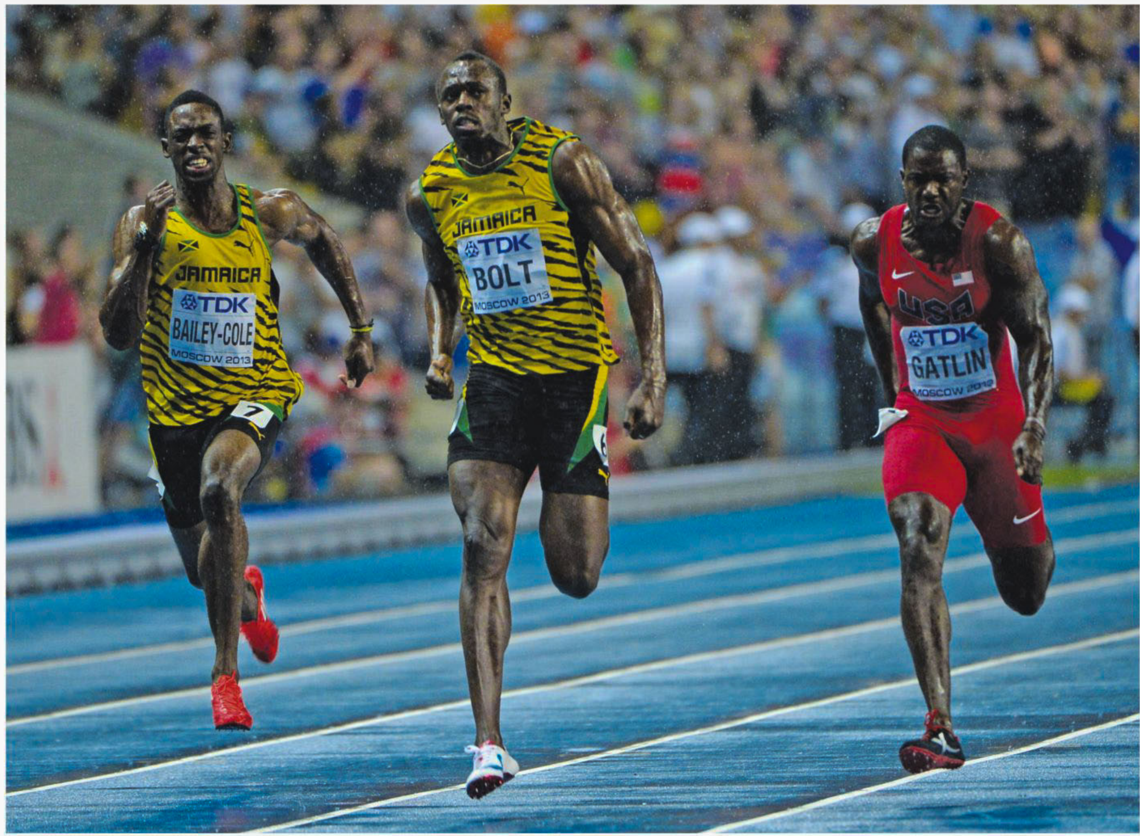
World's fastest man Jamaican Usain Bolt (C) leaves the chasing pack in his wake to win the blue riband men's 100 metres gold in the IAAF World Championships at the Luzhniki stadium in Moscow yesterday.

Speculations however will finally come to an end over the next two days. Ashraful is expected to know his fate before the scheduled press conference on Monday. "They have let me know that they are coming and they told me that they would talk to me on Monday and let me know the finer details," Ashraful told The Daily Star.