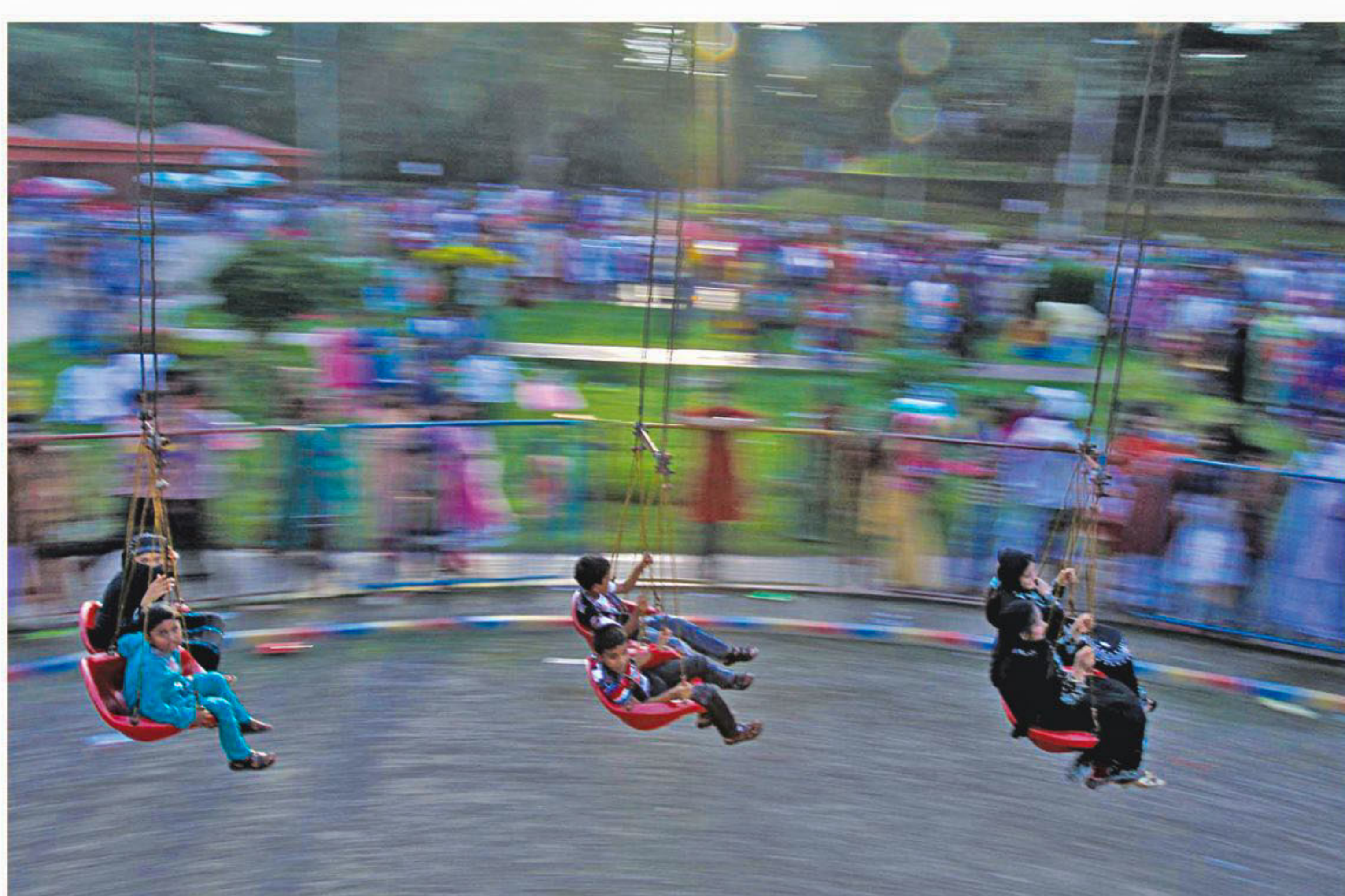
The swing ride proves a favourite for children and adults alike at Shishu Park in the capital on Saturday during the Eid holidays.

An unidentified man, aged around 35, died after a train ran him over in Tongi Railway Station area of Gazipur city on Saturday. On information, police recovered the body, clad in a red t-shirt and chquered lungi, from the rail tracks and sent it to Dhaka Medical College Hospital for an autopsy.