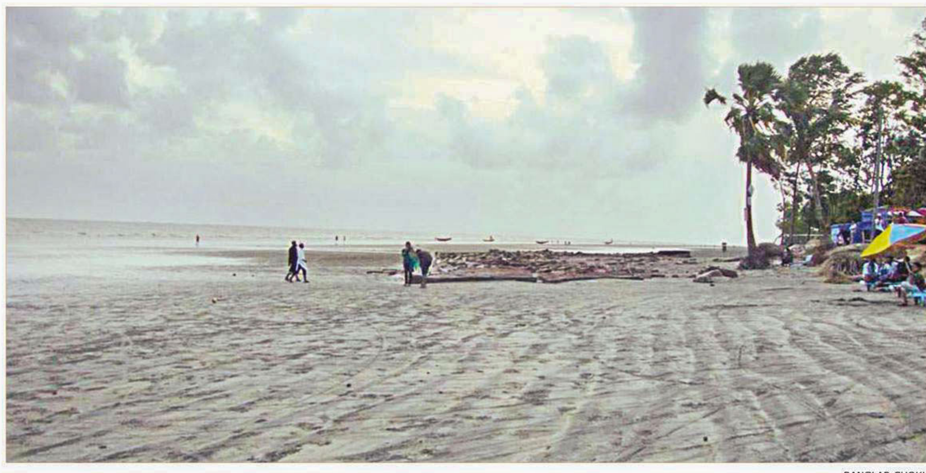
The seabeach in Kuakata looks deserted as many tourists have changed their tour plans due to the two-day shutdown starting August 13.

Tour operators, hotels and airlines fear huge losses