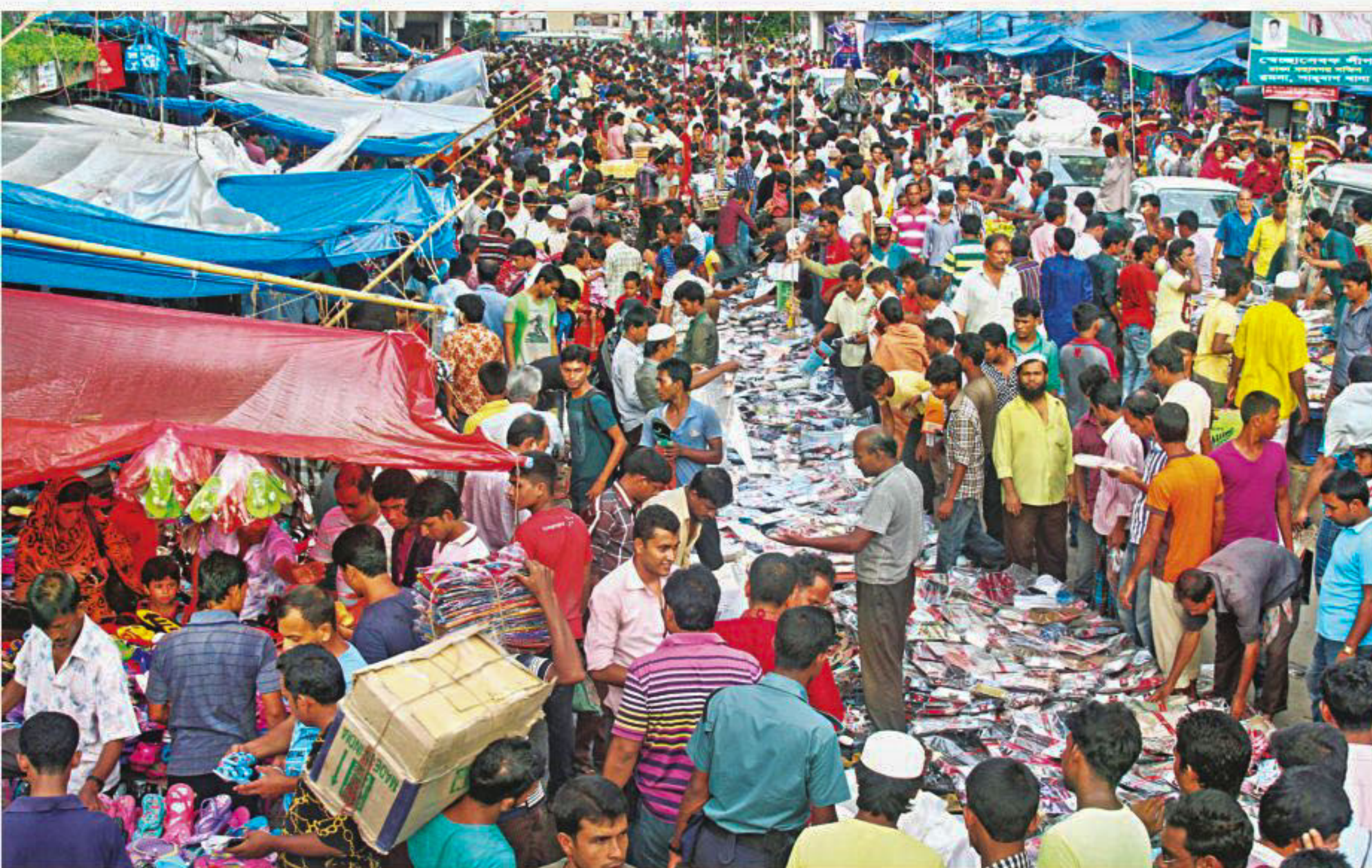
A few days ahead of Eid, low income people go on a shopping spree in the capital's Gulistan, where vendors and traders have set up makeshift stalls to sell garment items their prospective buyers can afford.