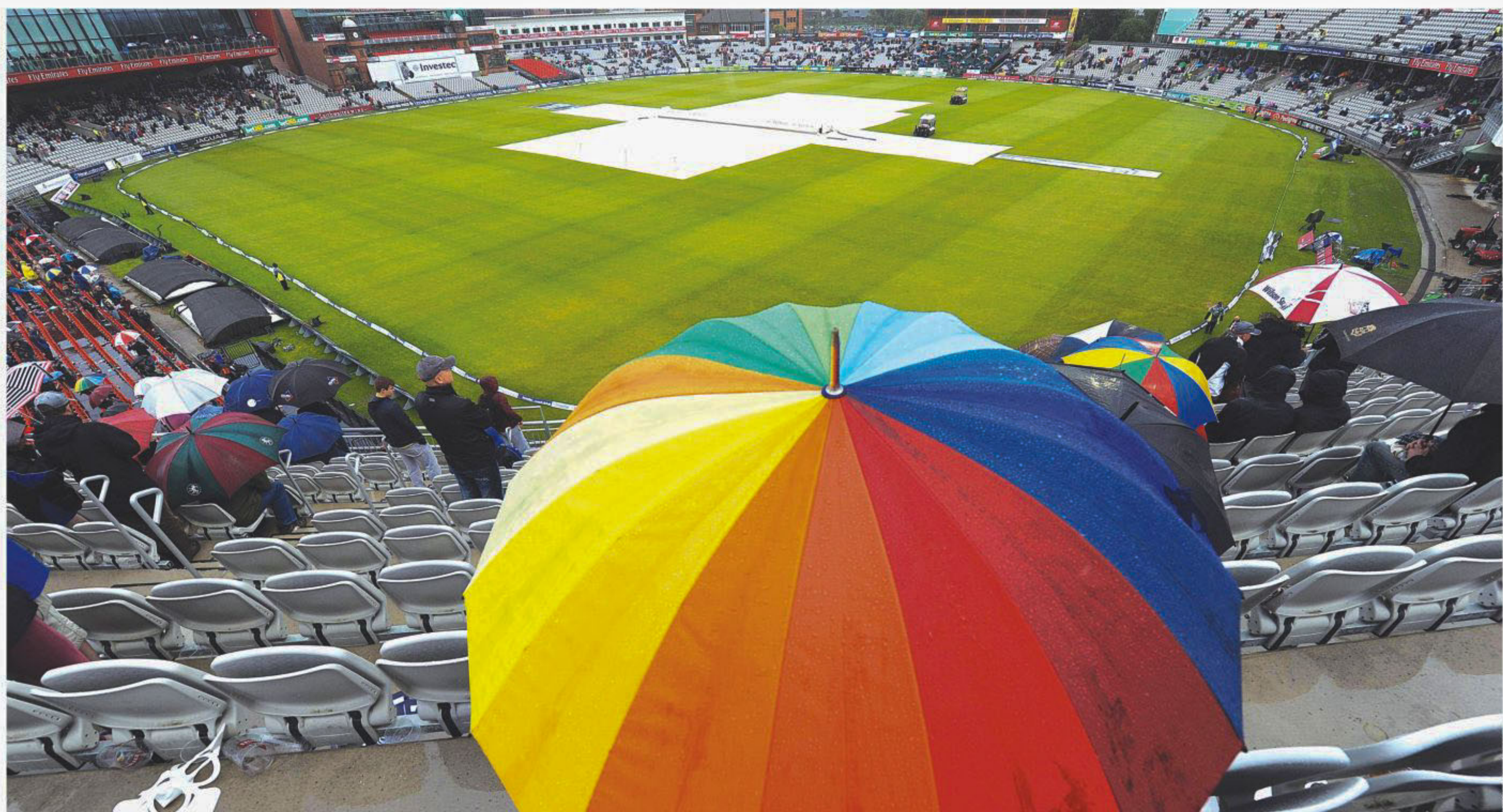
RAIN RULES: Weather played the part of 12th man for England as rain washed out most of the fifth day of the third Ashes Test at Old Trafford yesterday. Australia, needing to win the Test to have any chance of regaining the urn, had England on the ropes at 35 for three at lunch in chase of 332 before rain allowed the home team to escape with a draw.

Installation of floodlights and preparation of the grandstand are the major challenges in Sylhet. Since last month the army has joined in the construction of the temporary stadium in Cox's Bazar, which will host the women's edition of the global event.