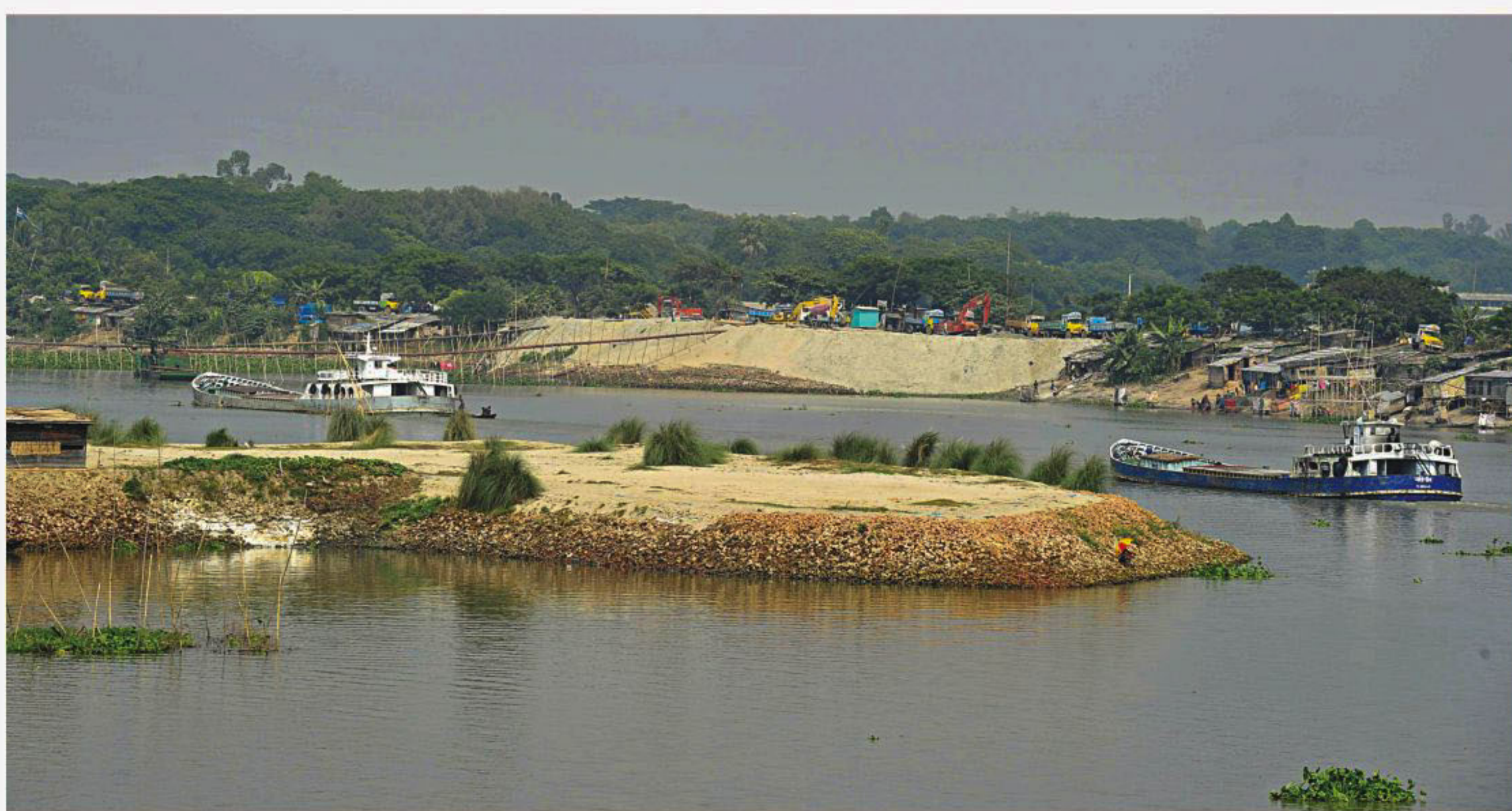
A vested quarter has been filling up the Turag near Sinnirtek in Dhaka's Mirpur area, day by day narrowing down the vital river at this point. The photo was taken from Mirpur embankment.