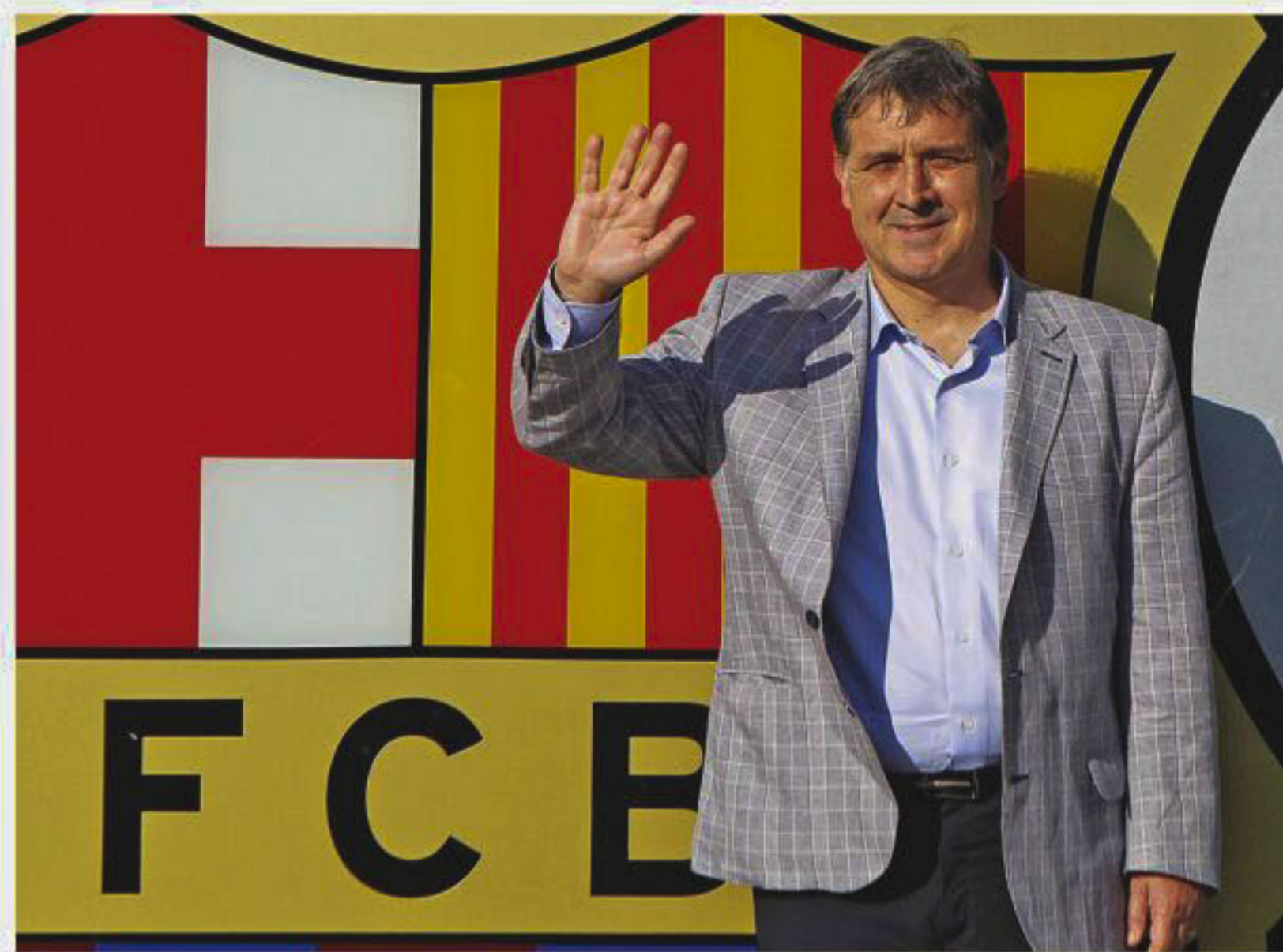
Barcelona's new coach Gerardo 'Tata' Martino poses during his official presentation at the Nou Camp yesterday.

Barca hired Martino after Vilanova was forced to step down due to illness as he is known to favour the club's possession-based playing style.