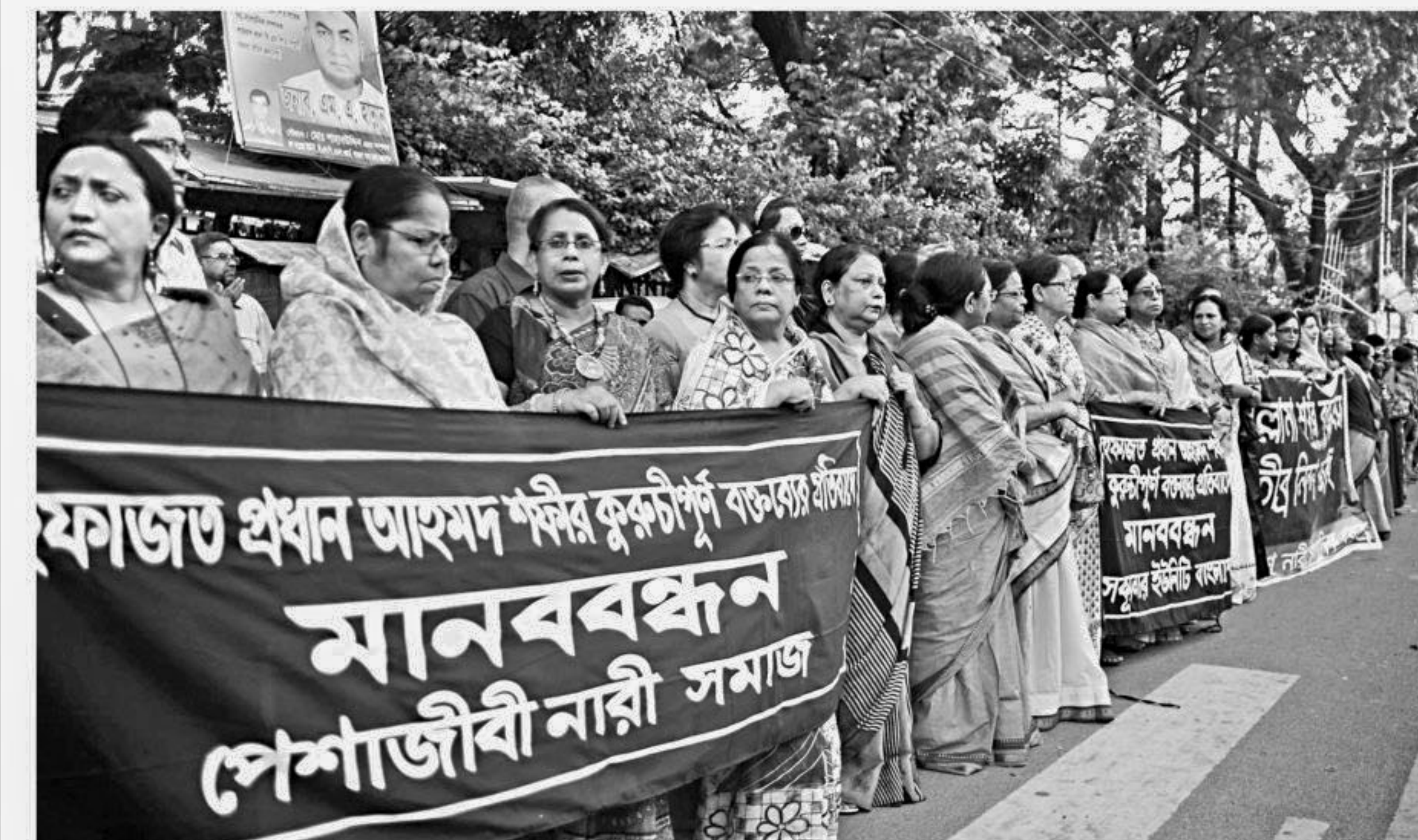
Several organisations, under the coordination of Peshajibi Nari Samaj, form a human chain in front of Jatiya Press Club in the capital yesterday, denouncing the indecent and misogynist sermon of Hefajat-e Islam chief Shah Ahmed Shafi, the video clip of which has been recently available on internet.