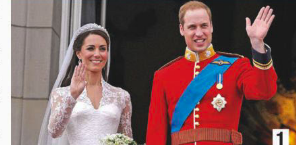
1 Prince William and his wife pose after their marriage in 2011. 2. Charles and Diana shows off their newborn son William in 1982.

realms, which would mean that a girl could no longer be overtaken by any future younger brothers. The royal couple used a back entrance to the hospital when they arrived at 6:00am, missing the ranks of international media who have camped outside the hospital for three weeks. The prince was born in the same hospital wing and media from across the globe are hoping for a repeat of the scene in 1982 when Charles and his first wife Diana brought out the baby to show him off to the world. Royal fanatics gathering outside the hospital also took their excitement to a new level. The new arrival is Queen Elizabeth's third great-grandchild, and a first grandchild for Charles. It ensures that there are three generations of heirs to the crown of the United Kingdom of England, Wales, Scotland and Northern Ireland -- a nuclear-armed UN Security Council permanent member and the world's sixth biggest economy.