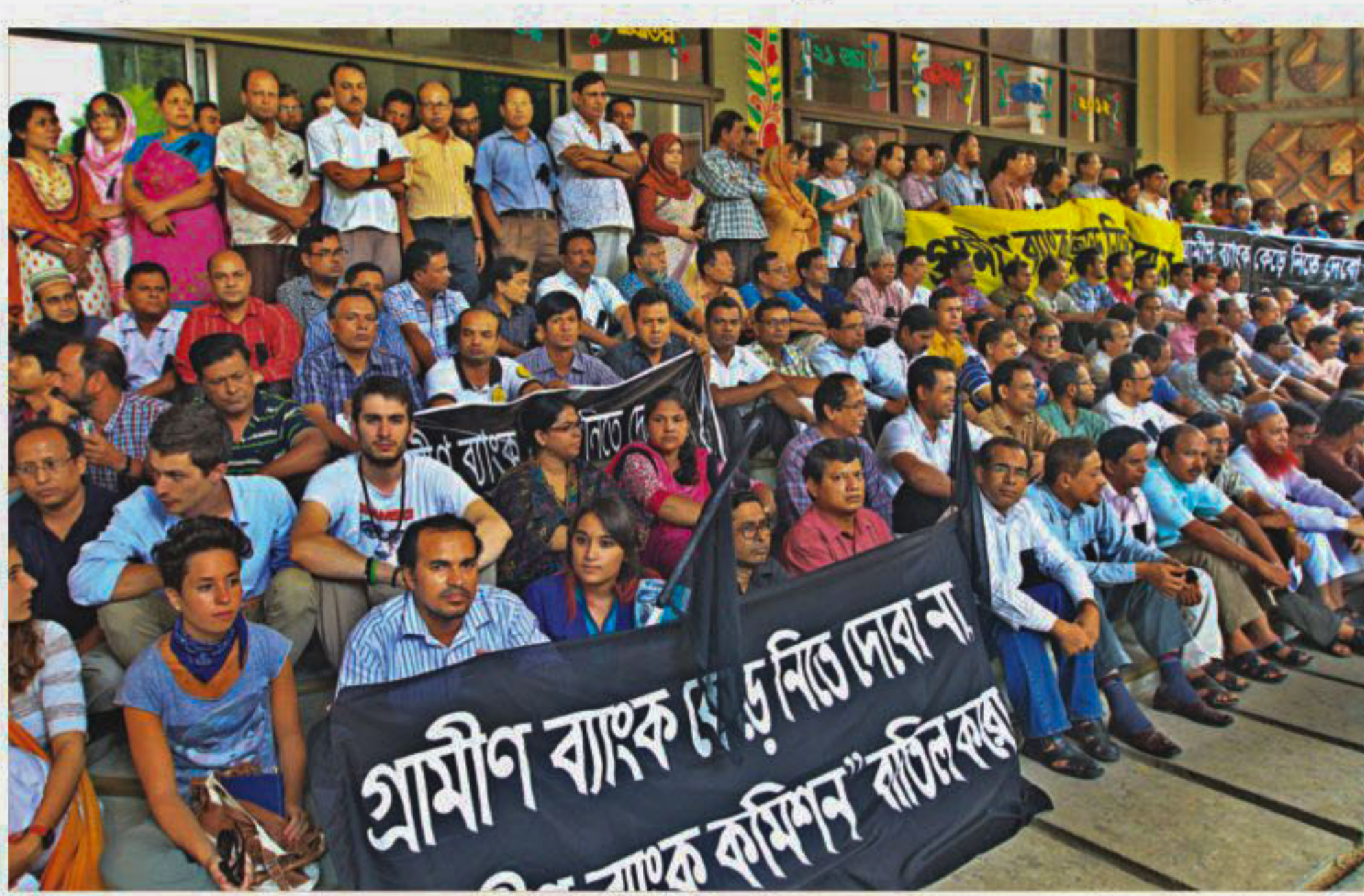
Grameen Bank employees stage a sit-in at the bank's headquarters in Dhaka yesterday with a vow to save the Nobel-winning organisation from any 'takeover' bid.