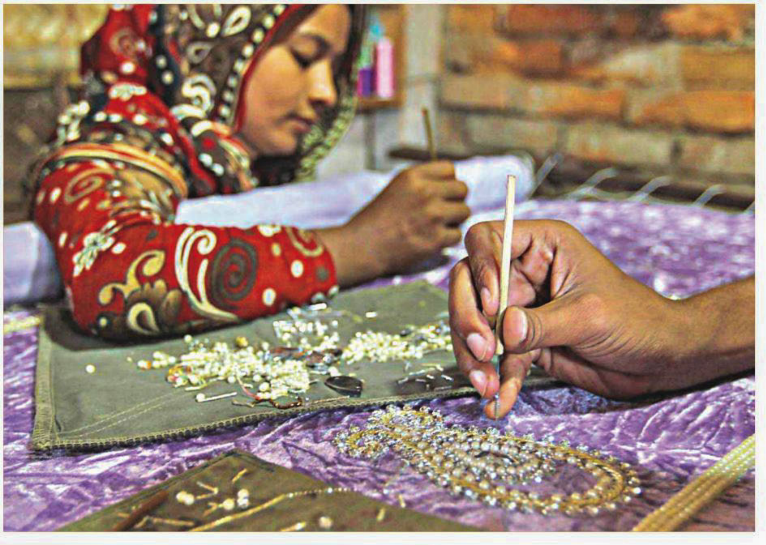
People living in Ambagan Jhautola Bihari Colony of Chittagong city make motifs on dresses. The dresses end up in fancy shops and malls of the port city. With Eid almost here and time for shopping running out, the people of the colony are working flat out.