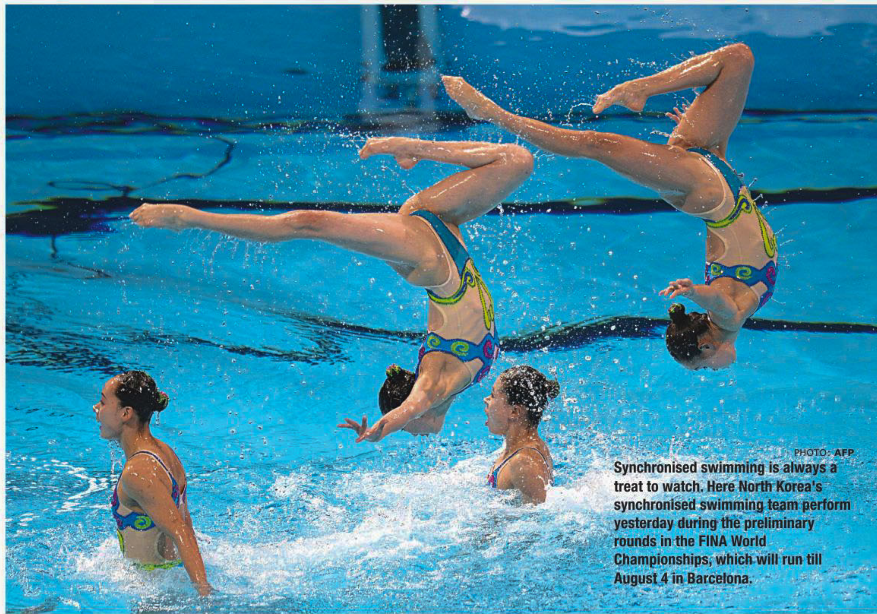
Synchronised swimming is always a treat to watch. Here North Korea's synchronised swimming team perform yesterday during the preliminary rounds in the FINA World Championships, which will run till August 4 in Barcelona.